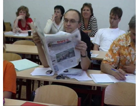
Figure 2. Non-standard element b

These non-standard elements of didactic situation must be solved by the "teacher" using situational decision.