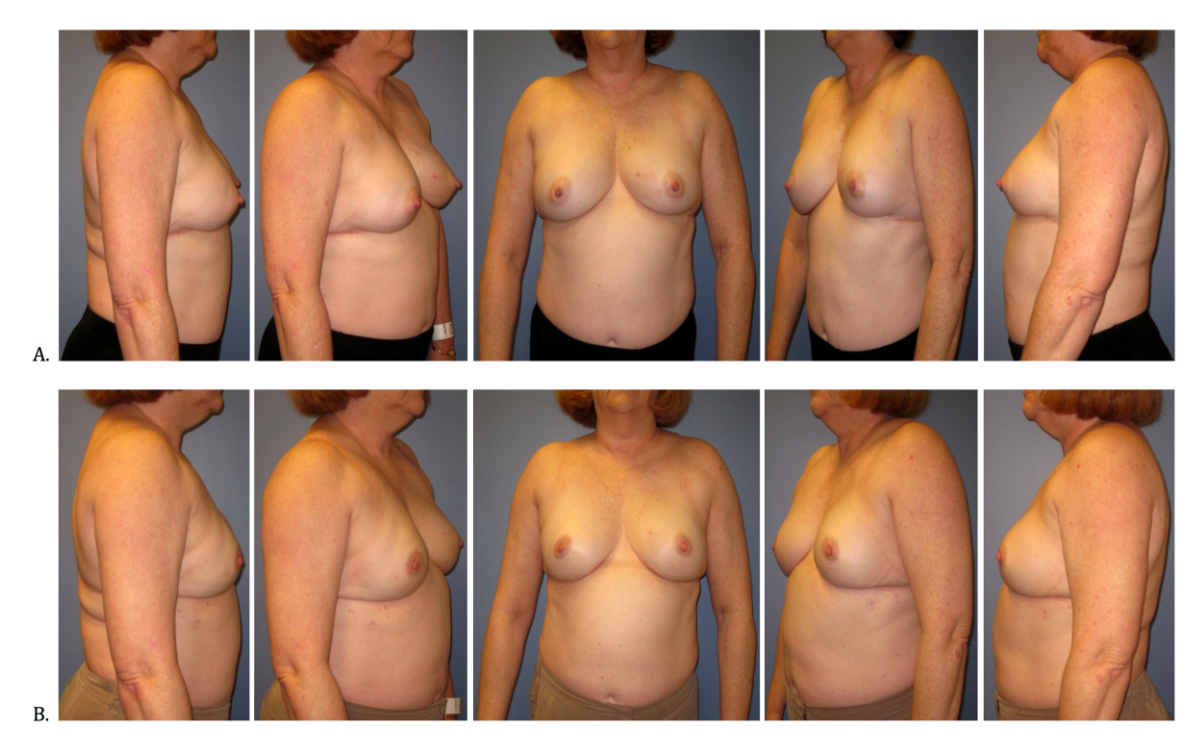
Figure 3. 57 year old female with left DCIS. A. pre-operative; B. post-operative after bilateral NSM via IMF incision with tissue expander and silicone breast implant reconstruction