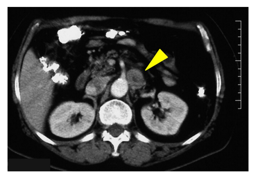
Figure 2. Computed tomography demonstrated enlargement of para-aortic lymph node, which measured 20mm in diameter (#16a2)

Therefore, the patient received chemotherapy with S-1/cisplatin. A 3-week regimen of fluoropyrimidine S-1 (40 mg/m<sup>2</sup>, orally, twice daily), together with cisplatin (60 mg/m<sup>2</sup>, intravenously, day 8), was administered to the patient, followed by a 2-week rest period. The dose of chemotherapy was decreased in the second cycle, because of grade 3 nausea which was assessed according to the Common Terminology Criteria for Adverse Events version 4.0 (CTCAE v. 4.0). After the eighth cycle of chemotherapy, lymph node #16a2 was shrunk significantly, although the primary lesion was slightly accreted (Figure 3). Levels of the CA 19-9 serum tumor marker decreased to 1090 U/ml. Following eight cycles of chemotherapy, the patient underwent D2 gastrectomy and esophagojejunal Roux-en-Y anastomosis. Regarding lymph node #16a2, the intraoperative sample was frozen and diagnosed as negative for cancer cells.