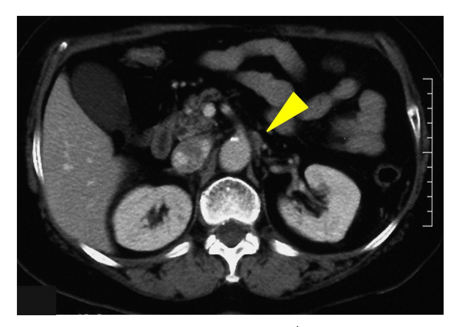
Figure 3. Lymph node #16a2 was shrunk significantly after 8<sup>th</sup> cycle of S-1/cisplatin chemotherapy

She had an uncomplicated postoperative course and was discharged 17 days after surgery. The serum CA 19-9 and CEA level became negative after surgery. The patient received oral fluoropyrimidine S-1 adjuvant chemotherapy for six months. She has been living for three years without recurrence.