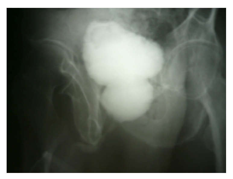
Figure 3. Urethrocystogram three weeks after surgery

intoxication or electrolyte abnormality, and no patients needed blood transfusion. Approximately half of the patients experienced stress urinary incontinence immediately after the removal of a balloon catheter on the third postoperative day. Incontinence gradually improved and disappeared at 3 months postoperatively. Bladder neck contracture developed in 38 patients (33.0%) mostly 3 to 4 months after the surgery. Other complications included cerebral infarction in 1 patient, pulmonary embolism in 1 patient and acute epididymitis in 3 patients, pubic osteitis in 2 patients and clot retention in 2 patients, but none led to patient death. Erectile function was preserved in 20 (51.3%) out of 39 patients who were potent before surgery. Figure 3 is a voiding cystourethrogram 3 weeks after surgery, showing the filling of the seminal vesicle with contrast medium and marked dilation of prostatic urethra with no extravasation.