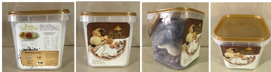
Figure 3. The Kao Tung packaging

1) After the researchers applied all gathered needs into developing Kao Tung packaging, the result was illustrated in Figure 3. During the development, the created packaging prototype was evaluated by the experts and revealed a high level of all criteria as shown in Table 1.