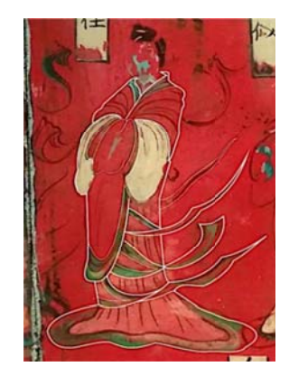
Datong City Museum's collection, Shanxi Province

The screen paint-drawings from Sima Jinlong cemetery in the Northern Wei Dynasty