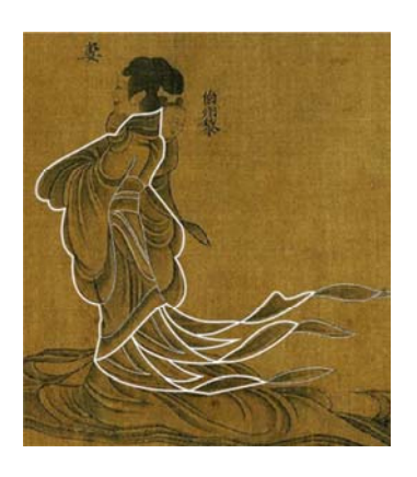
The Palace Museum's collection

The Painting Roll of Virtuous and Wise Ladies