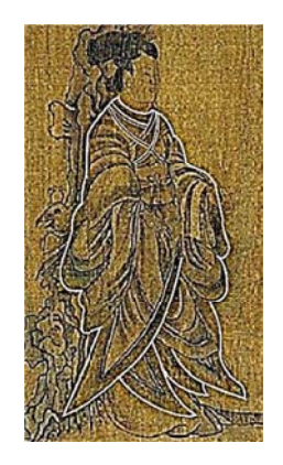
The Palace Museum's collection