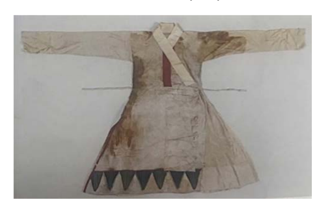
Figure 2. A coat with decorative triangles