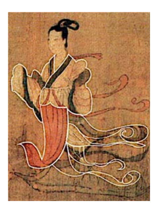
The Palace Museum's collection