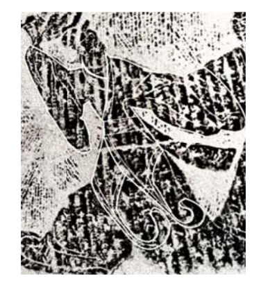
Cultural Relics Management Institute, Sichuan