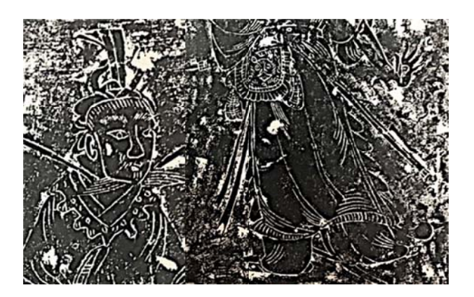
Figure 3. Portrait stone of the Han Dynasty in Yinan, Shandong