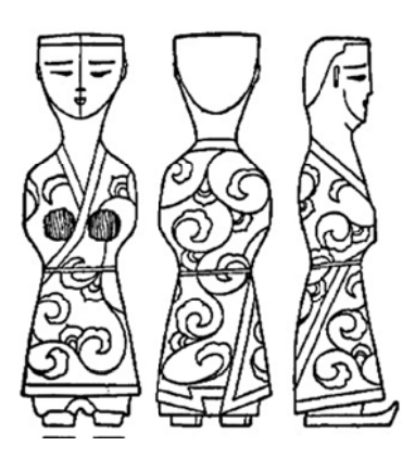
Figure 6. painted wooden figurines Unearthed in the tomb of the Western Han Dynasty in Yunmeng, Hubei

A tomb of Western Han Dynasty was discovered in Yunmeng County, Hubei, in 1973, Three painted wooden figurines were unearthed in the tomb, among them there was an upright figurine in a robe, of which the corner of its robe were curved, and two pieces of the front intersected, wrapped the body and hung behind it (Figure 6) (Chen, 1973, p. 31). As Supplement Notes of the Han History recorded, 'Jiao-Shu, which is a kind of cutting way in ancient China, is to cut off the whole textile across corners, and make one end of the textile as narrow and small as the swallow tail, hung on both sides of the body when sewn with the edge of a robe, which can be seen from behind. Jia Kui in Han Dynasty called this robe style as Yi Gui (Ban, 2008, p. 3574). Ancient people in China stressed regular and square when tailoring, which means to take the positive of cloth and silk. So in Western Han Dynasty, Ru Chun called it 'cutting fabric positively'. Jiao-shu cutting, diagonal cutting of the fabric in ancient China, ie. bias-cutting. Jiao-shu cutting was used to tailor Gui-pao in Han Dynasty, making the