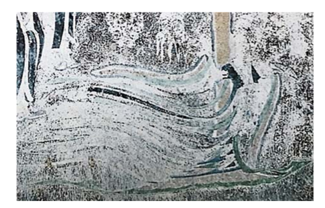
Figure 7. Cave 285<sup>th</sup> of Mogao Grottoes, Gansu