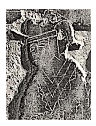
Figure 4. Wu Lejun portrait stone in Han Dynasty