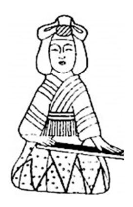
National Museum's collection