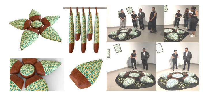
Figure 8. The seat cushion design prototype and the blossom former of timesof the aroma cushion work exhibition show

Regards to the loop design in order to keep after used it by hanging which could be safe the area space, as shown in the picture.