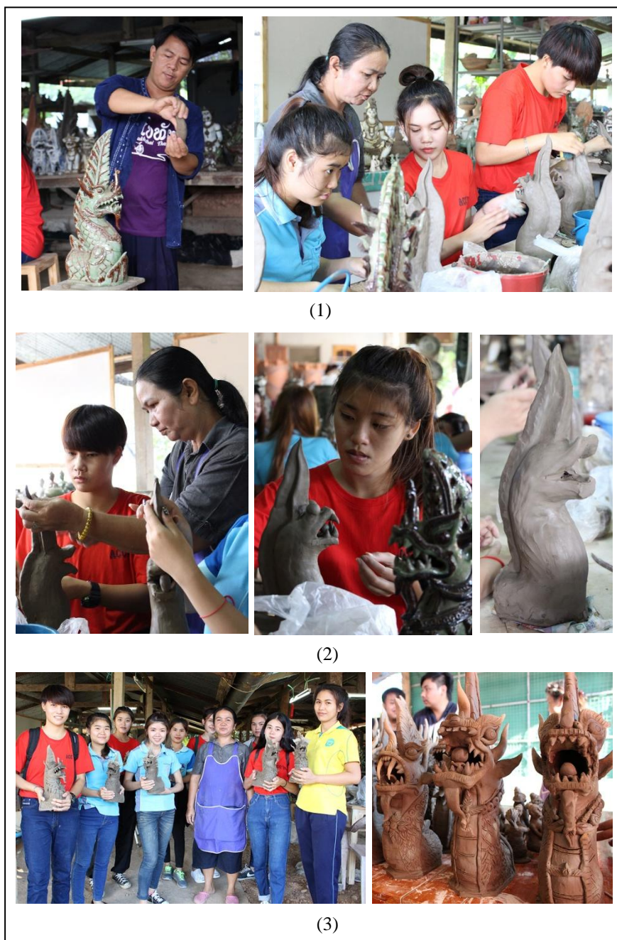
Figure 2. Examples of learning and practical activities of how to build ceramics: (1) Building Naga, (2) Community instructors' demonstration of how to build Naga/student's practice building Naga, (3) Finished Naga.