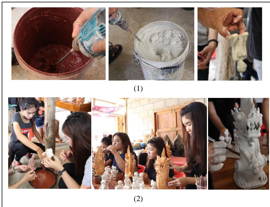
Figure 3. Learning activities on decoration with glazes (1) Community instructors' demonstration of how to prepare liquid glaze, (2) Student's practice of glaze dipping/graze brushing.