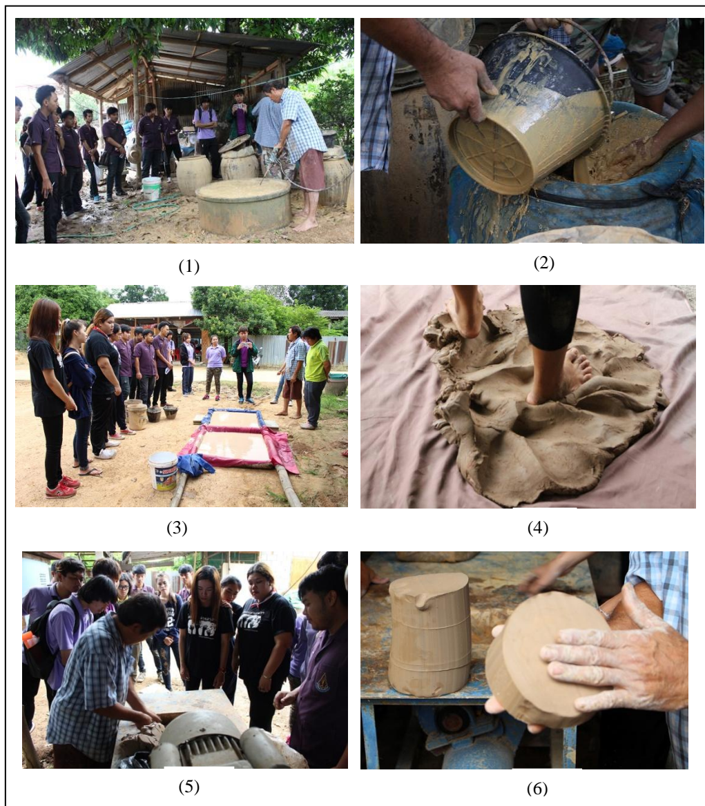
Figure 1. Learning activity in clay bodies preparation processing (1) Use the drill to blend the clay previously leaven for at least 2 days, (2) Filter liquid clays, (3) Bring filtered liquid clays to sunlight, (4) Once half-dry, tread the clay by foot, (5) Knead the clay with roller to remove air bubbles, (6) The appearance of roller-kneaded clay