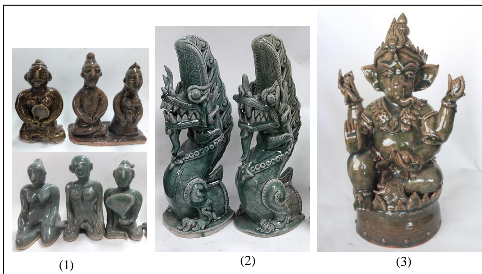
Figure 4. Samples of student's finished works by ceramics creative process with CBL and constructionism: (1) Human dolls, (2) Naga, and (3) Ganesha