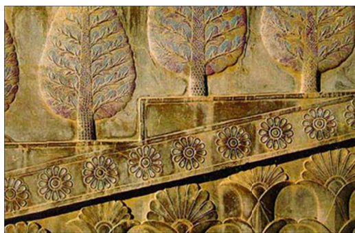
Figure 4. Picture of Cedar and Nenuphar flower on the body of eastern stair of Apadana palace, Persepolis (Dadvar & Mansuri, 2006, p. 102)

Cedar also has been in attention from the old days and has been the special sign of Iranians. Among the desired signs of Iranians, we cannot find a symbol as acceptable as Cedar. In the Iran plateau, with its dry and warm condition, Cedar is a symbol of persistent life and prosperity. This ever green and raised tree has had a special stand among Aryan tribes and in sculptures of Persepolis has been used with detail intricacies and horizontal branches. During Achaemenid and Sassanid eras, this tree has been used as the life tree.