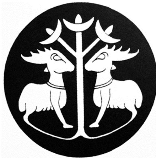
Figure 3. Mark of imprint of Sassanid era, image of two horned animals on both sides of date-palm (life), (Dadvar & Mansuri, 2006, p. 103)

The importance and sacredness of both plant and tree in Iranian myths and beliefs are reflected as “tree of life” (Figure 1). “Tree of life” which usually is seen in pictures and scripts positioned among two monks, priest or two mythological creatures as its guardian, is regarded as secret of sacred force. To pick its fruits which results in elixir of long life, one should fight with its guardian monster. Everyone who wins the battle can get the supernatural level and immortality” (Dubuker, 2008, p. 13).