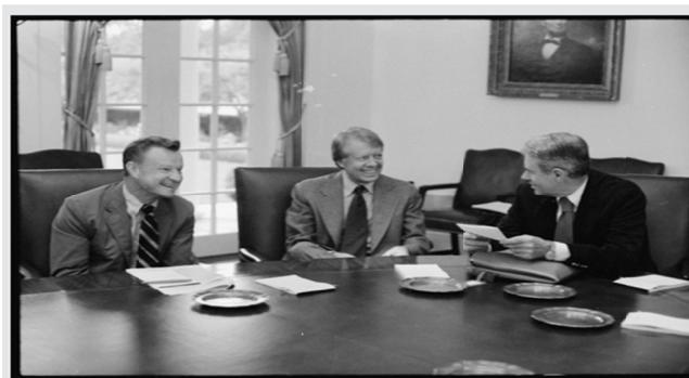
Figure 3. President Carter, National Security Adviser Brzezinski, and Secretary of State, Cyrus Vance (U.S Policy Makers during Soviet-Afghan War)

Brzezinski further added that U.S should response to Soviet through regional security, unilateral actions, and multilateral actions. He explained the U.S actions and said that U.S already increased the covert program for Afghan Mujahedeen against the Soviet Red Army in Afghanistan and further will be updated after the recommendations of reviewing committee; military aid for Pakistan has been recommended; deploying of U.S brigade to maintain the effective military power in the Gulf region; cooperation with Saudis to deploy the Airborne Warning and Control System (AWACS) in the region; and consultation with Turkish, Iranian and Indian Governments about the Afghan situation. (Note 38)