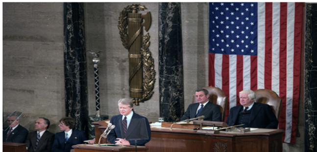
Figure 1. President Jimmy Carter presents his State of the Union Speech to Congress, 1980s http://www.newsmax.com/FastFeatures/jimmy-carter-state-of-the-union-president/2015/03/22/id/631735/

Carter also directed that American troops should present in the Gulf region also continue exercises, training and other activities. Regional defense should also be improved through jointly programs, financial assistance and combined training with regional allies. The President also ordered that U.S also allocates full American resources to his NATO, European and Asian allies to protect the Gulf region. (Note 20)