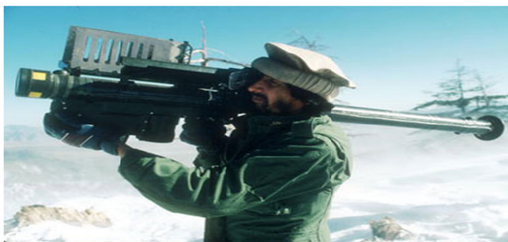
Figure 5. An Afghan Fighter with U.S Made Stinger Missile, February 1988