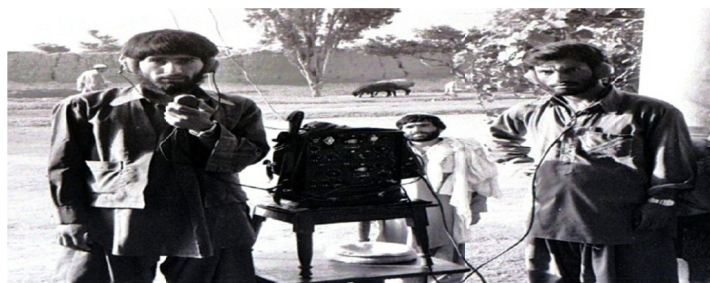
Figure 4. Mujahedeen with U.S provided communication receiver https://upload.wikimedia.org/wikipedia/commons/a/ad/Muja_on_radio_in_Munda_Dir.jpg

During 1981, Casey began support to Afghan covert program. In the first month of 1982, CIA telegram to Casey for more supply to Afghan Mujahedeen for more pressure on Soviets in Afghanistan. Hence, on February 26, 1982, Casey and Frank Carlucci, Deputy Director of Central Intelligence, decided to funnel an additional 20 million dollars for Afghan Mujahedeen. In the last months of 1982, the Afghan covert program reached 60 million dollars per year (Ibid, p. 251). With the more efforts of Casey for pump up the Afghan covert program, Congress authorized additional ten million dollars from Pentagon’s massive treasury account, which never used before. Even various Congress members were not agreed with in option but Casey got his objective (Coll, 2004,