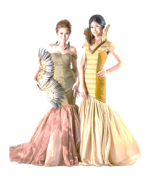
Figure 15. Evening gowns inspired by GRIFFIN (Lion and Eagle)