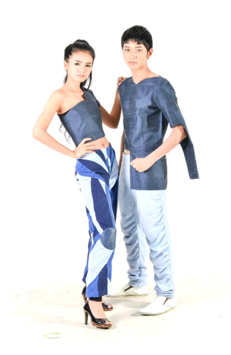
Figure 18. Lady and gentlemen outfits inspired by ANUBIS (robust and wearing a canine mask)

The Unicorn Capricornus and Anubis designs draw signature characteristics of each type of animals to design attires. The fabrics used are woven fabrics from the enterprise community and chiffon fabric, a very thin, almost transparent cloth of silk or nylon. The colors are brown, ivory, and green. Later, the beads and embroidery floss