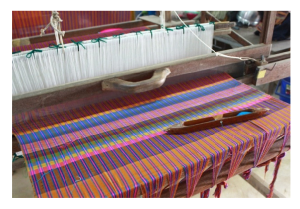
Figure 5. Plaid pattern with many colors; showing heddle with warping ikat