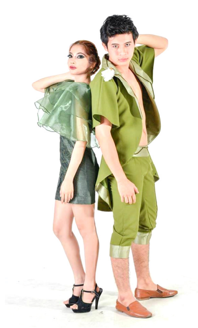
Figure 17. Lady and gentlemen outfits inspired by CAPRICORNUS (sea goat)