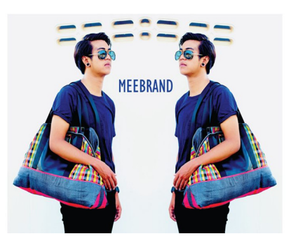
Figure 12. Duffle Bag- suitable for male teenagers. The material is plaid woven fabric of Community Enterprise Group