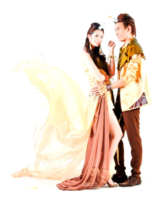
Figure 16. Lady and gentleman attires inspired by UNICORN (an imaginary white creature like a horse with a single horn growing from the front of its head.