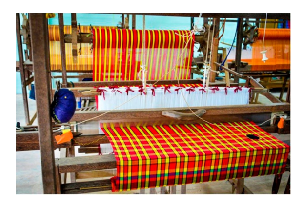
Figure 6. showing weaving a sheet of plaid pattern with different color threads; with tiny or big grids as designed