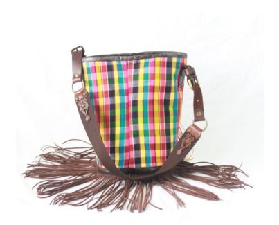
Figure 9. Bucket Bag- a bucket like bag decorated with leather strap and its bottom