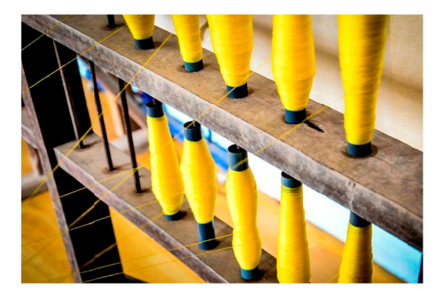
Figure 1. Thread cores for weaving