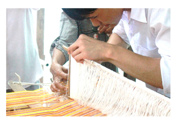
Figure 3. Connecting thread to loom

1. Put main thread onto the warp ikat cores and needle each line of thread into the heddle and comb. Then pull all warp ikats onto the other side of the core. Adjust appropriately. Finally, pull the thread into the heddle and it will be used as weft ikat.