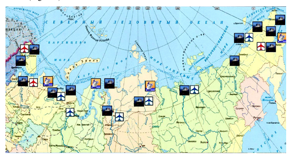
Figure 4. Benchmark points of AZRF transport system and prospective infrastructure

The first vessel from Sabetta is planned for shipping in quarter I, 2017 (Sytnik, 2013, p. 17). Continuous delivery of LNG from Yamal peninsula will be ensured by 4 icebreakers and a fleet up to 20 vessels with capacity of 140-160 thousand m<sup>3</sup> of gas. Sabetta is part of "Northern latitude course" project providing for railway branch to Sabetta, ensuring access of the unified transport system of Russia to the Arctic infrastructure and connection with Northern Sea Route (Figure 4).