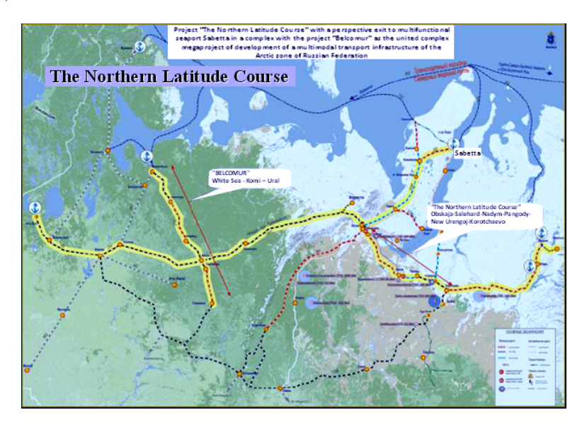
Figure 3. Transport scheme of "Northern latitude course" project

The intensification of Northern sea route in the country's Arctic policy is given a special place. On a sitting of Security Council on April 22, 2014 President of the RF Vladimir Putin stated that "it is required to work out an optimal economic model for the development of Northern Sea Route to make its traffic volume four million tons in 2015" (Sitting of Security Council, 2014). The significance of Northern Sea Route has not been decreased in the whole post-Soviet period while the traffic drop caused by economic reasons was overcome back in 1998 (Selin, 2014, p. 21).