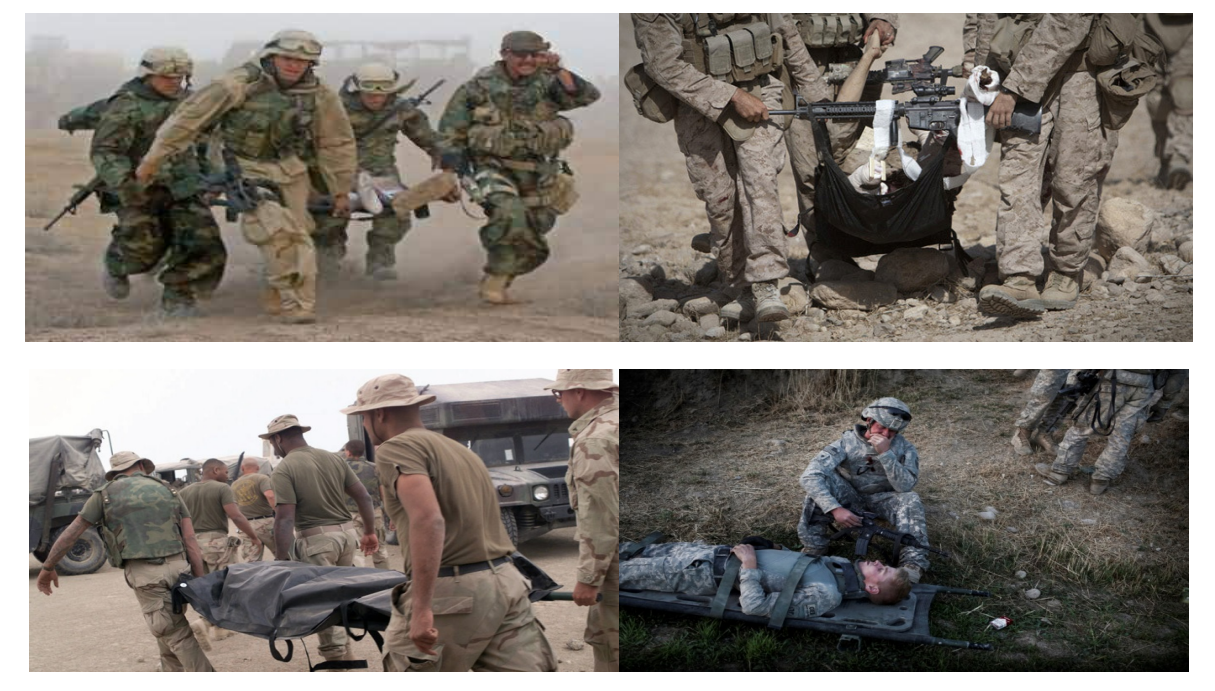
Figure 5. Wounded/dead soldiers at the battlefield

The persistent proclivity to represent women as victims is to convince the Westerners that women from Middle East need to be rescued from the brutalities of Muslim men. This exotic exhibition of many images of Muslim women is absolutely haunting. These images solicit sympathy for a Western viewer as it is very hard for them to see these images and resist interpellation. The Westerners desire to liberate and recognize Muslim women by lifting the burka and bringing them "barefaced in the West?" (Whitlock, 2007, p. 47). Pulling the Western eyes behind the chador or under the burka is an effective rhetorical approach; it draws out both "sympathy and advocacy" that can be put to quite "various political and strategic uses" (Whitlock, 2007, p. 47). These sorts of images can be called 'soft weapons' as the producers employ strategies to elicit sympathy from the Western readers. They can pack a punch in the world. When the Western viewers see these images is to the extent that Western viewers feel "these women are just like us" but living in a miserable and agonizing condition. This sentiment, the feeling of human engagement, creates a room for dialogue. This is what makes the current forms of images "potent yet flawed weapons for cross-cultural engagement and the pursuit of human rights" (Whitlock, 2007, p. 3).