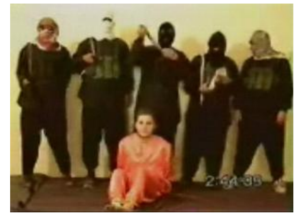
Figure 11. Beheading of Nicolas Berg