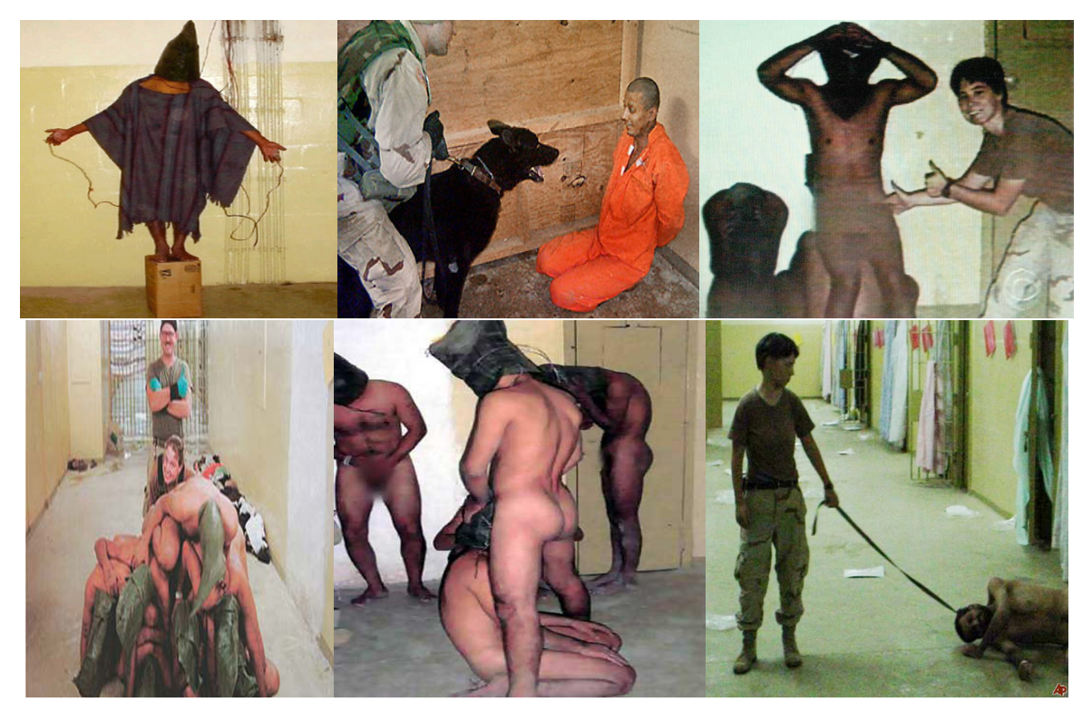
Figure 7. Images of Abu-Gharib prisoner abuse