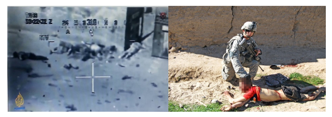
Figure 6. Killing Afghan and Iraqi civilians.