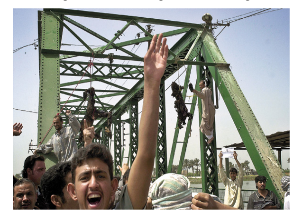
Figure 12. Two charred American bodies hanging from a bridge in Fallujah

Al-Qaeda was clever in exploiting the Abu-Gharib pictures to recruit more mujahidin to launch its operations. Abu-Gharib images drove jihadists to new lengths. Al-Qaeda decided to retaliate by beheading an American contractor (Figure 11). The American contractor, Nicholas Berg was kidnapped and executed in May 2004. The event was filmed as they wanted the images in the film to act as weapon. He was clothed in orange uniform and was posed lower in front of the group. His captors were wearing dark clothes and were standing behind him