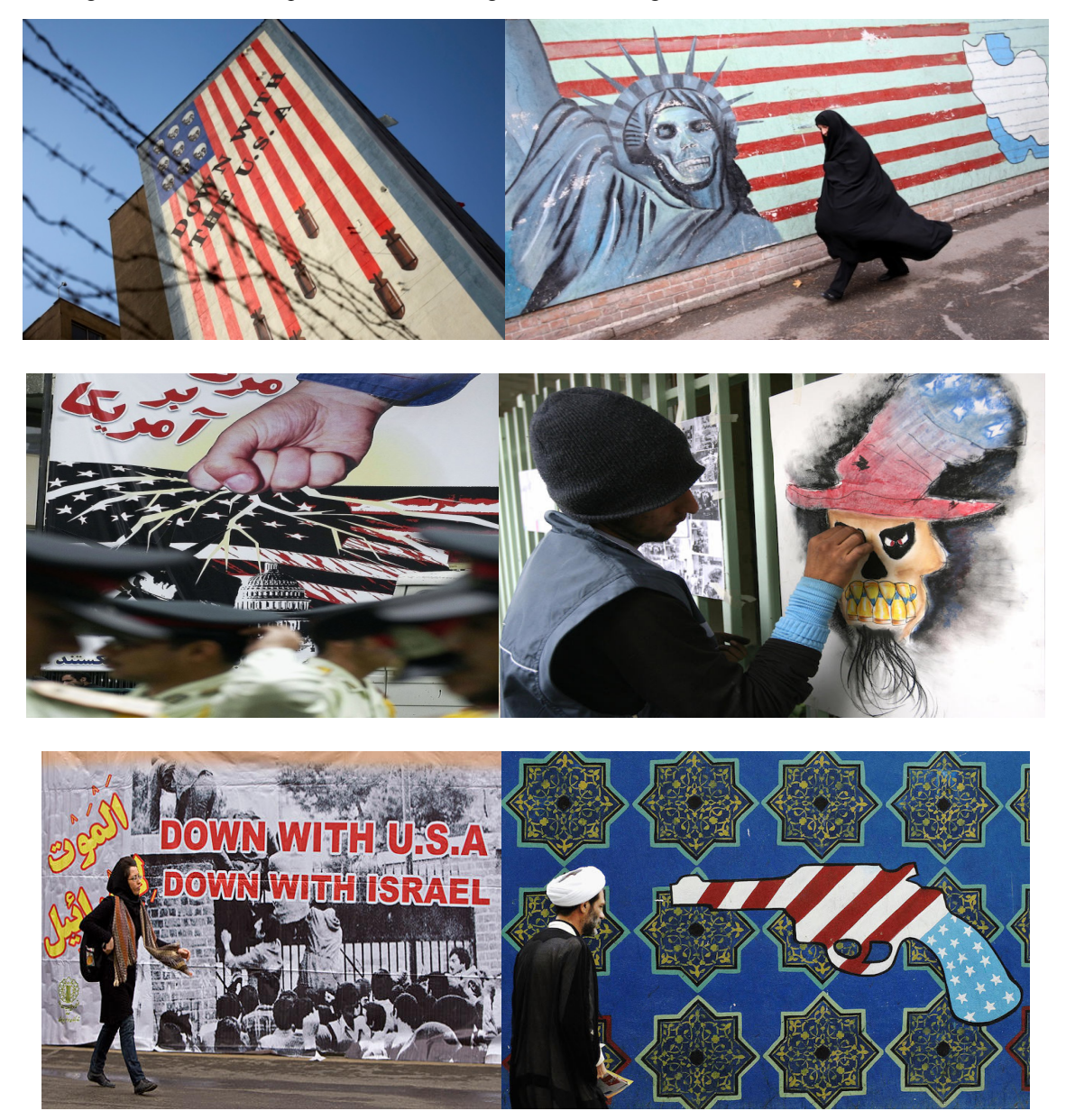
Figure 10. Anti-American murals in Tehran