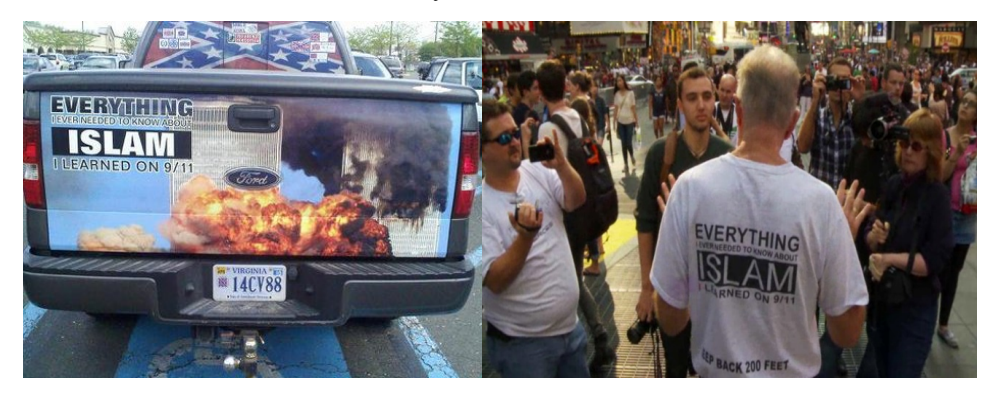
Figure 3. Anti-Islam images

Accompanying 9/11 images were anti-Islam images in which Islam and 9/11 were linked; anti-Islamic images and mottos were gaining currency not only in media but they could also be seen as murals and on T-shirts (Figure 3). This sort of images increased the hostility towards Muslims so much so that post 9/11 West has witnessed many hate crimes against Muslims and Arabs. According to a report by FBI, the hate crime against Muslims has increased by 1,600 percent from 2000 to 2001. Hundreds of aggressive events experienced by Muslim and Arabs were documented, several murders have happened, many airline passengers who were Muslims or look like one were refused entry to the planes, many Arabs and Muslims were openly discriminated at work, they have received hate mails and their properties, mosques and their community centers were set on fire or vandalized (Alsultany, 2013). The root cause of this aggression was the prevalence of 9/11 and anti-Muslim images acted as catalyzers to gain people support for 'war on terrorism.' America and its allies were ready to launch the 'war on terror' and the best way to commence it was to manufacture consent.