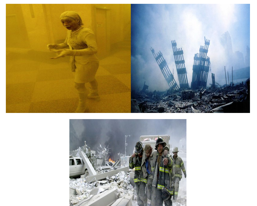
Figure 2. Images of 9/11

The American public was shaken dramatically by realizing that its space and citizens were susceptible to the kind of disastrous terror attack took place that morning (Kellner, 2007). Suddenly many Americans, who were sure of their safety, invulnerability and supremacy, lost their sense of certitude. Bailey Jones (2007, p. 9) argues that this