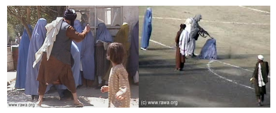
Figure 4. images of women living under Taliban

Images of Muslim women as veiled, powerless, silent, abused and victims of patriarchal societies bombarded the Western countries. Images about the oppression of Muslim women have been in demand. Images with titles such as "Under the Veil," "Lifting the Veil," "Beneath the Veil," "Under the Burka" and "Unveiling Freedom" promised the Western viewers to take them "beneath the veil" to bring to light the mysterious lives and reveal for the Westerners why Muslim are terrorists. These images show Islam as a backward and terrifying religion; Islam is shown a religion in which women are facing female genital mutilation, being beaten and killed for love and violating the dress code, being stoned to death for adultery and unable of getting a child custody in cases of divorce (Alsultany, 2013). To corroborate that these images are true representation of Islam and Muslim women, several Muslim women have been asked to go on air to explain women's plights in Muslim countries. One of these women is Ayan Hirsi Ali from Somalia who has written books about the incompatibility of Islam with democracy and has talked widely about the situation of women in Muslim countries. Hirsi Ali has made a lucrative career by defecting from Islam and becoming spokespersons for its innate brutality. Invited to CNN's Anderson Cooper 360 to talk about Muslim women and commenting on a Saudi Arabian woman who was raped and lashed, Hirisi Ali (2007) said: