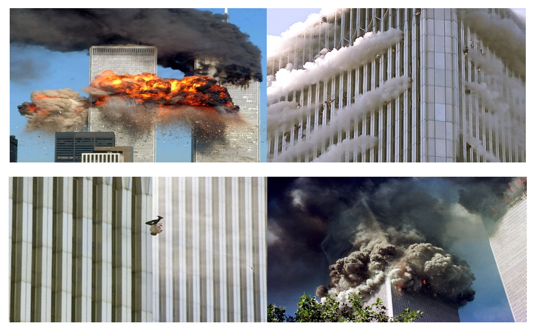
Figure 1. Images of 9/11, courtesy Getty Images

9/11/2001 is a day Westerners, especially American will never forget. It was a day when four planes were hijacked, two of which were flown into the World Trade Center towers, one was directed into the Pentagon building and the other was crashed in a field. The attacks were launched by the Muslim terrorist group Al-Qaeda which killed almost 3,000 people. Minutes after the crash into the World Trade Center and Pentagon, media outlets reported the atrocities. The 9/11 attacks became one of the most breathtaking media drama in history. Images of crashing the World Trade Center as the heart of America's symbolic power and Pentagon as the symbol of U.S military power abounded the media. Images of Twin Towers billowing with smoke and fire prior to their collapse, people fleeing the fire by hanging from the windows and jumping driven by the scorching temperatures and by the brink of fires, and the collapsing of the towers will forever remain ingrained in the memory of the public (Figure 1). They have been etched in the mind of many Americans. These images which became symbolic representation of terrorist attacks rose to iconic status as they possessed the strength to impact people and produce a public memory of the incident (Hatfield, 2006).