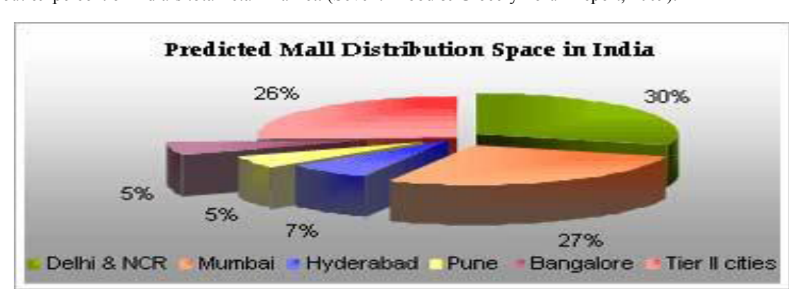
Figure 1. Predicted Mall Distribution Space in India

A panel from Seventh Food and Grocery Forum pointed out that the grocery and food retail in this country will be about 69 percent of India's total retail market. (Seventh Food & Grocery Forum report, 2009).