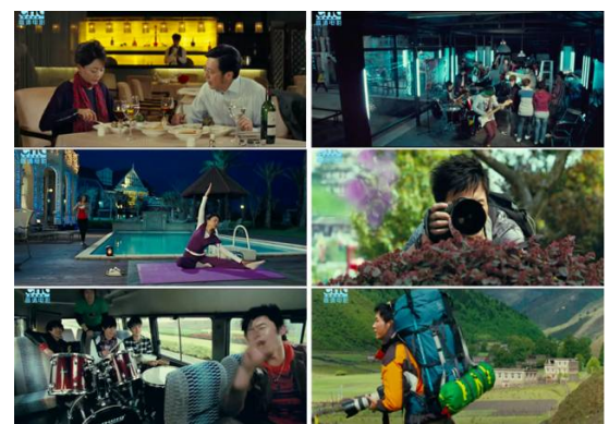
Figure 21. Modern activities

these are just complex and threadbare. Moreover, excessive commercials and rebel youth intensively stimulate nerves of people in big cities.