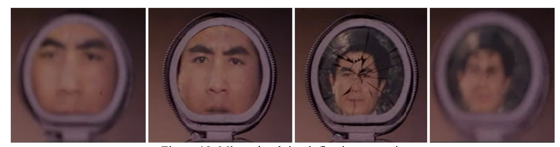
Figure 10. Mirror-implying inflection scenario