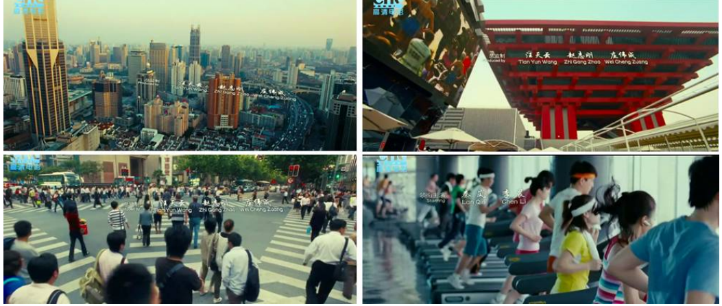
Figure 20. Screenshot in beginning of movie

"Romance on Lushan Mountain 2010" gives a vertical view of Nanjing through a full circle panorama in the beginning. Then flows of the crowds and communication are shown horizontally, which shows a rapid pace of life in Nanjing. Four fast moving shots-from right to left, from down to up, from up to down and from left to right-present high-rise buildings in Nanjing. Finally, the heroine Geng Feier is running in the gym with dynamic background music. All of these lay a foundation for metropolitan, fashionable and rapid atmosphere for the film.