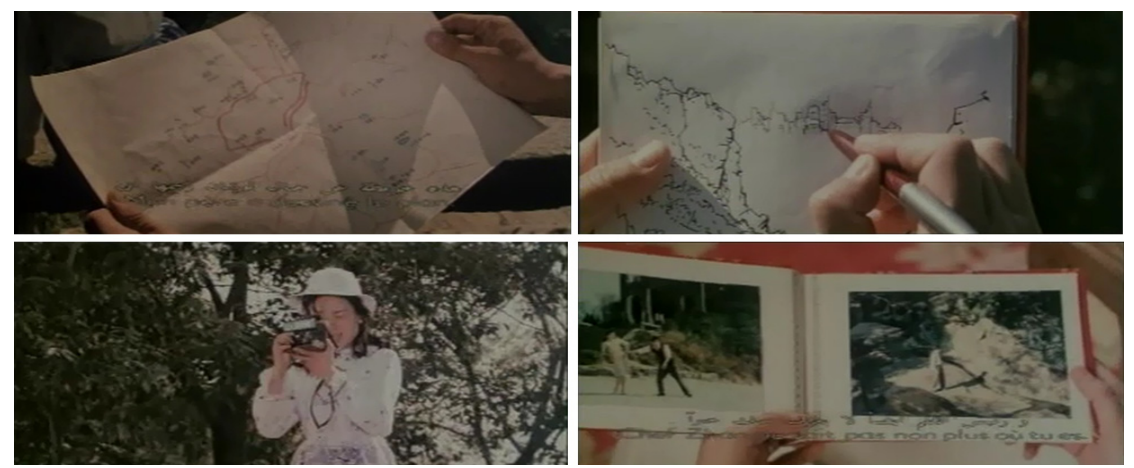
Figure 7. Screenshot of maps, sketch paintings, cameras and photo

In contrast, Zhou operates Polaroid camera to shot visual landscape of Lushan, indicating young women's travel experience and social activities, and playing a more important narrative function in re-establishment of Lushan landscape and relationships, forming a private life expression in contrast to natural landscape containing national or ethnic significance. Thereby, a visual culture system is established and composed of map, photographs, sketches paintings and other visual text forms in the movie, and matched with character dialogue and voiceover for scenery introduction, thus contributing to knowledge-based expression on natural and cultural landscape of Lushan(Figure 7).