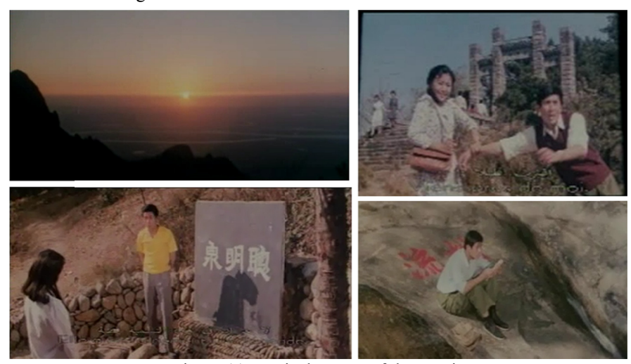
Figure 11. Typical scenes of the movie

A few typical scenes in "Romance on Lushan Mountain" (1980) have still affected image construction of tourist destinations and related activities till now. Thereinto, one is Flow Stone attraction where hero and heroine meet as previously described; the other is the place where both hero and heroine watch the sunrise in Lushan Mountain; as well as Bright Spring where they drink spring, and Hanpo Pass where they take photo (Figure 11). These scenarios establish imagination and expectation of audiences on Lushan successfully, and thereby they are able to personally experience such the scenarios in actual tourism (Figure 12); to this end, people said, and one who fails to watch sunrise in Lushan is not a real visitor to Lushan. This is one of influence from the movie on the tourism destination marketing.