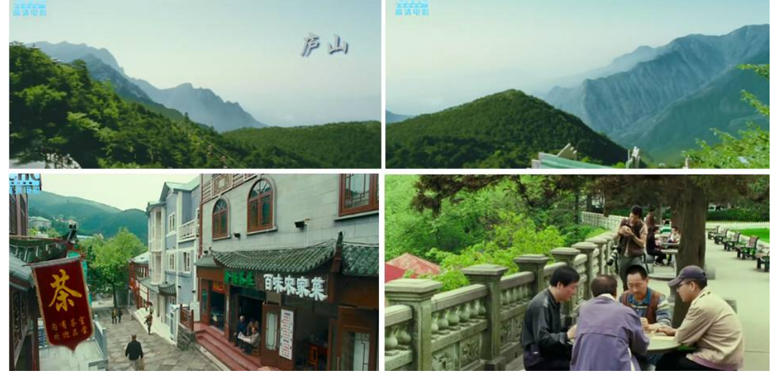
Figure 16. Natural Scenery and Cultural Atmosphere in Lushan Mountain

film shows an old lane in Lushan Mountain from a downward angle and local people playing Mahjong from a close shot, which aims to show the cultural atmosphere from people's daily life. Remote and soft music is chosen as the background music, along with chirping, makes audience feel rejuvenated