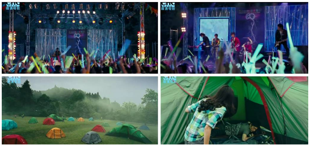
Figure 19. Concert held in the Mountain and Camping

(3) Modern Love in the Background of Metropolis