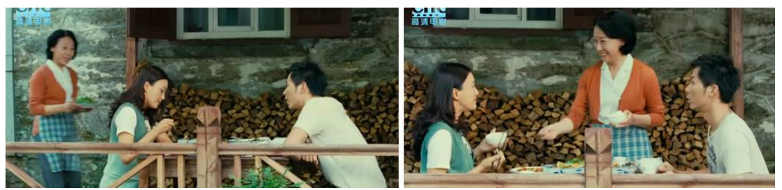
Figure 18. Potherb and Reminisce of Ma's Mother

As shown in figure 19, in "Romance on Lushan Mountain 2010", concert held in the mountain and camping construct a fashionable and vigorous Lushan Mountain. The concert is shot from the distance to the near, from a distant view, full view, close and side view, medium view and close-up view, together with the use of push forward angle, low angle and rotation angle, accompanied by heavy-metal rock 'n' roll, present a excitement and hilarity. Camping is shot from a downward angle, emphasizing peaceful, broad and cloud-surrounded feeling. And the fresh background music also triggers the imagination of audience, thus brings about the tourist motive besides viewing the natural scenery. This is the construction of fashionable activities in Lushan Mountain.