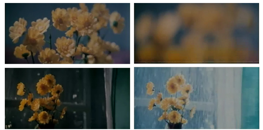
Figure 9. Two flowers scenes

In "Romance on Lushan Mountain"(1980), a lot of scenes are integrated with external natural environment and other elements to express the scenario inflection. In "River-viewing Pavilion" attraction, Zhou and Geng meet again in time of taking shelter from rain, and fall in love each other. After the scenario, both two are further familiar with each other and go out for travel together. This scenario expresses inflection of scenario structure by utilizing weather and light change. Another set of scenarios appear in Zhou's house, Zhou is greatly happy and pleased when Geng comes for her, as well as she makes a cruel decision to refuse Geng in order to protect Geng. Both images are expressed with the same bunch of flowers; the previous is based on repeated conversion between close-ups to close-range perspective; the latter is highlighted with thunderstorm night background (Figure 9). Another scenario appears in last inflection point of the story where a mirror is broken when Geng and Zhou are unable to continue their relationship due to the reason from their last generation, in a repeated conversion approach between fuzzy and clear perspective, thus to imply the heroine's sadness (Figure 10).