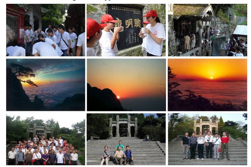
Figure 12. Construction of tourist destinations