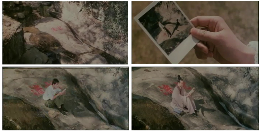
Figure 4. Screenshots of "Flow Spring"

The two leading actors meet in Flow Stone, whose full view is shown from the distant to the near in the heroine's angle (downward angle). When the heroine is taking pictures, the hero intrudes without intention to read books. The film describes the concentrated hero as a dull "Confucius" by using four montage shots. However, it is just his dullness that attracts the heroine. At this time, Chinese zither music, a fitting backdrop to the hero's image, also draws audience attention.