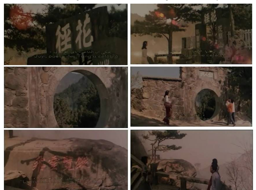
Figure 5. Screenshots of the Heroine's Visit Alone

When the heroine visits Lushan Mountain alone, she passes Flow Stone, Flower path, Fairy Cave, Fantastic Rock, all of which are shot from the near to the distant (the focal length changes from short to long). These shots, edited together without break and accompanied with soft music, are presented slowly in the film.