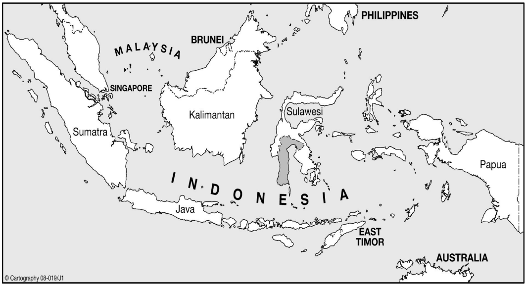
Figure 1. Indonesia, indicating South Sulawesi

My fieldwork was conducted in two different Bugis locations, Bone and Parepare (see Figures 1 and 2). I chose to concentrate on Bone and contrast the situation in this rural area with that in Parepare, the principal Bugis city, where I expected to observe speakers of varying dialects, in often impersonal urban settings.