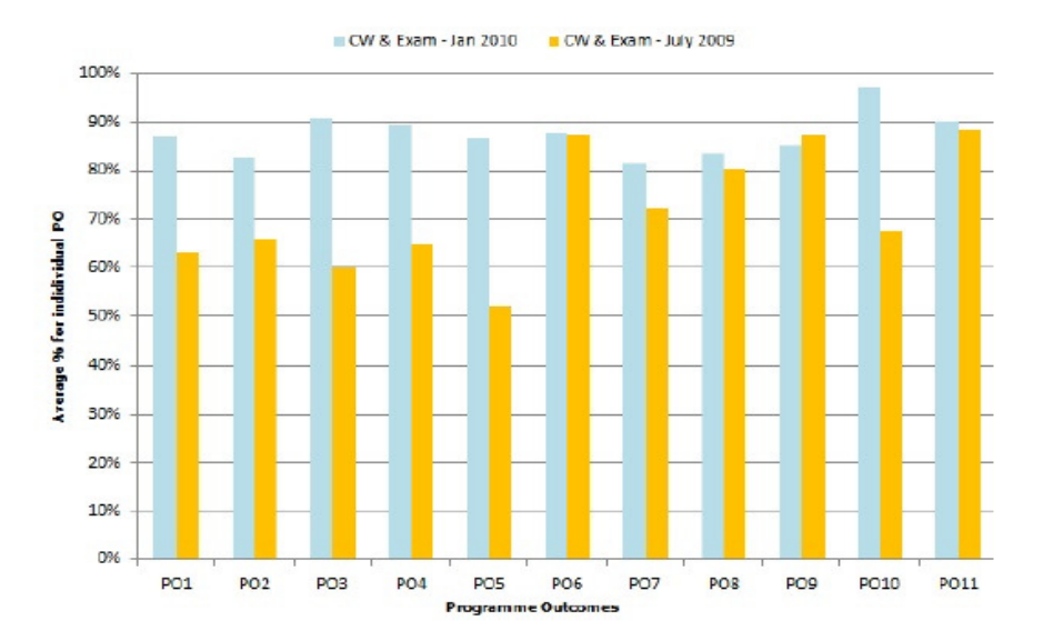
Figure 2. Examples on how PO assessment results are presented