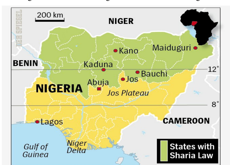
Map 1. States with Sharia law in the Northern region