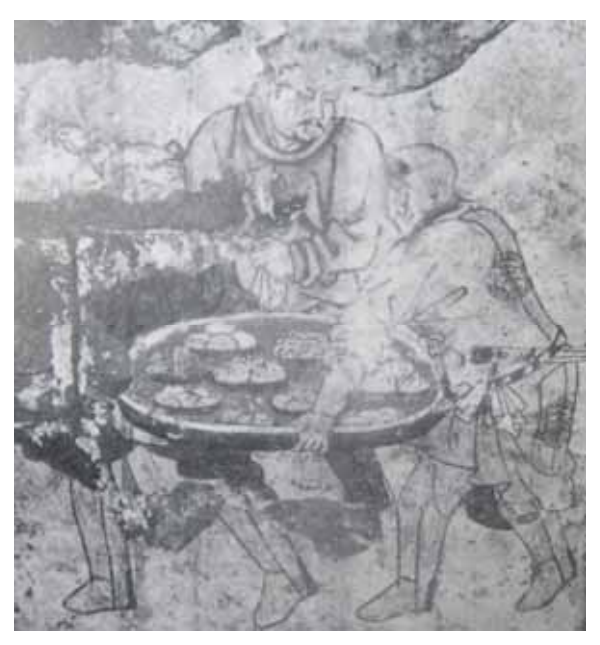
Figure 2. Drawing of a tomb mural from Dishuihu, Balinzuoqi, Inner Mongolia