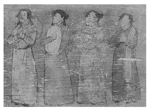
Figure 4. Part of a painting on the board, Wuwei, Gansu