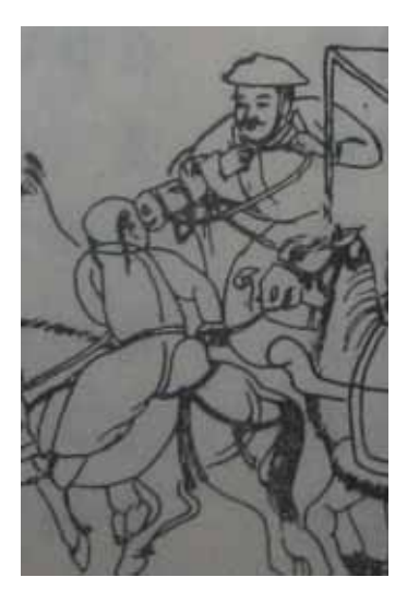
Figure 6. Part of the Study Sketch of mural painting from Xiao Yi Tomb, Yemaotai, Liaoning