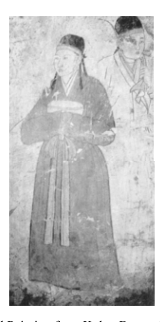
Figure 3. Mural Painting from Kulun Banner, Inner Mongolia