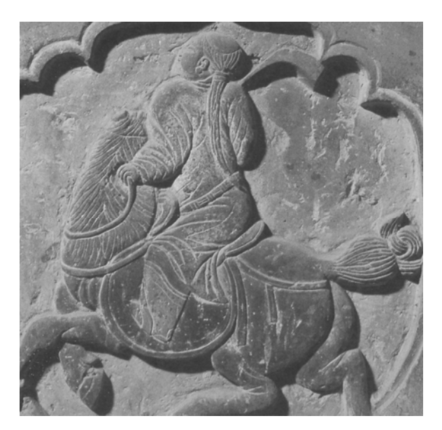
Figure 5. Tile carving from Dong Hai Tomb, Houma, Shanxi