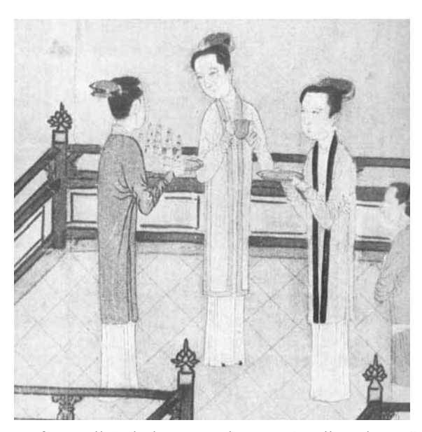
Figure 1. Part of a scroll 'painting Yao Tai Bu Yue'attributed to a Song painter

Yuwenmaozhao. (1986). Da jin guo zhi jiao zheng (an revision of the records of the Jin Dynasty II). Beijing: Zhong Hua Books Co. p.552.