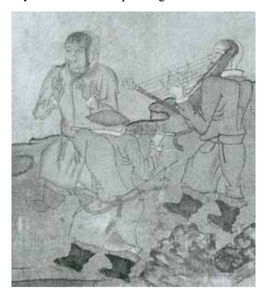
Figure 7. Part of a scroll painting 'Avalokitesvara' excavated from Heishuicheng, E'ji'naqi, Inner Mongolia