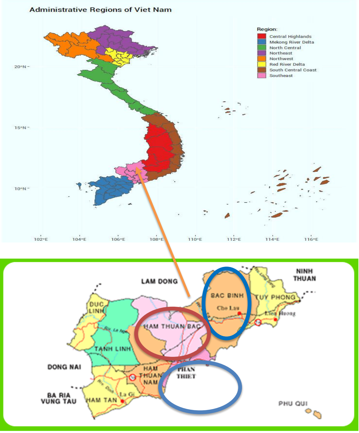
Map 1. Binh Thuan province and research areas