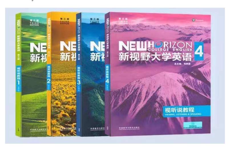
Figure 3. English textbook used by participants from Tao Bao

The author spent three weeks to have English lesson with participants after receiving permission from their English teachers and becoming familiar to the students during 2021-2022 academic year by using methods of semi-structured interviews and interaction online. After having English lesson with students, the author gets some information about the students' English learning situation. There are at least three semester English courses in their programme design, three courses per week and students can choose English teacher in course selection system at the beginning of every semester. The English textbook for these LOTE participants are New Horizon