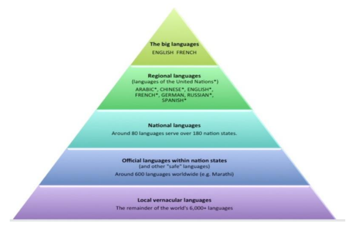
Figure 4. Global-language system pyramid from Wikipedia

Since China joined in the World Trade Organization (WTO) and held the 2008 Olympic Games successfully, China began to encourage English as the medium of instruction in education. According to Ingrid Pillar (2016), she draws on global-language system pyramid (see Figure 4) to show that there exists linguistic hierarchy of world languages. Ij this language pyramid, it can be seen that English is in the the peak of the pyramid, as 'hyper-central language' (Pillar, 2016). From this global-language system pyramid, it can be seen that LOTE like Myanmar, Thai, Vietnamese, Hindi are peripheral languages. English as global language has great impact on education policies and practice (Nunan, 2003), linguistics imperialism became a structure force urging people to learn English. Based on the context of English as hyper-central language, Students majoring in LOTE lean English can acquire benefits for their future life.