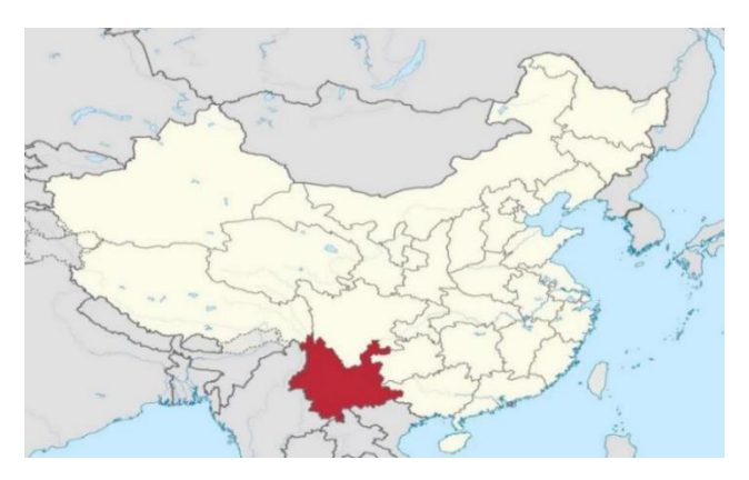
Figure 2. Location of Yunnan

This study aim to investigate English language learning experience of LOTE learners at Chinese frontier in the context of English as global language. In order to examine frontier's LOTE students' investments in English, we chose a border university as research site, which is located in Yunnan province (Figure 2), China's frontier. This border university play important role in linking China and South and Southeast Asia. It has cultivated many LOTE personnel. It also has established eight LOTE majors, such as Myanmar, Vietnamese, Thai, Laos, Hindi, Malay, Sinhalese, Bengali, and established these LOTE degree programs for many years. Among them, Myanmar, Thai, Hindi, Vietnamese majors in this university have become China's first-class majors. However, these LOTE majors curriculum is composed by major courses and foreign language course (English). LOTE learners in this university are required to have English class in their first year and second year, at least three semester. Though China's Frontier has limited resources of English compared with the area in East of China