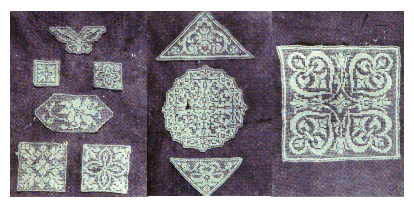
Figure 2. Filet Lace in Shanghai Lace Advertising