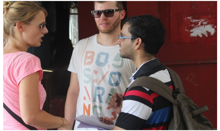
Figure 8. Understanding the perception of global citizens towards those who are visually challenged

Hence the events carried out by the volunteers over a period of time reinstated the message of road safety amongst the general public and encouraged them to help their visually challenged brethren.