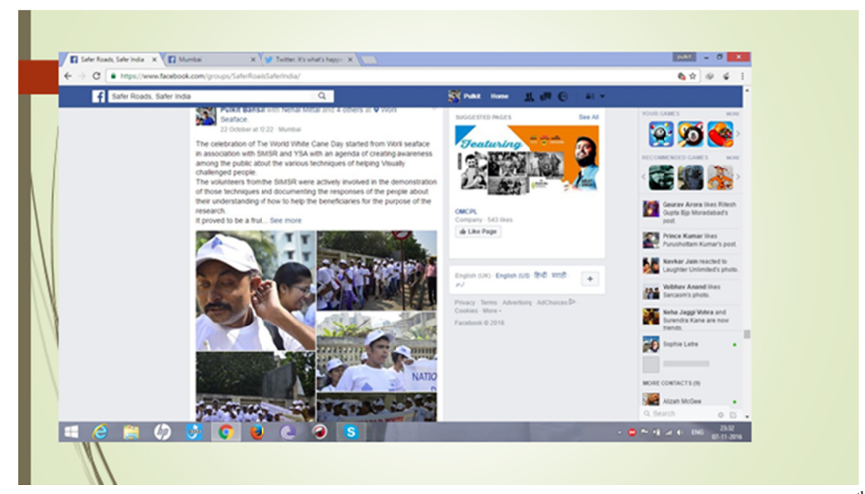
Figure 7. Facebook page for the activities carried out on occasion of World white cane day on 15th October