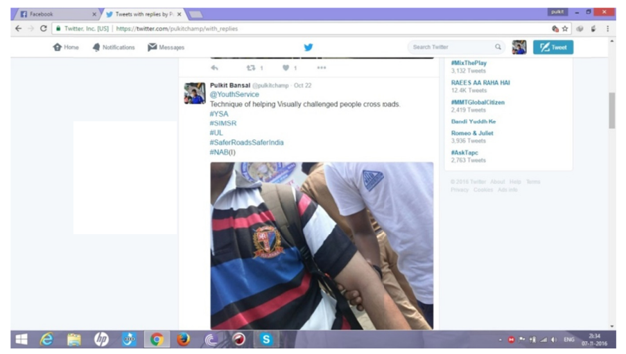
Figure 6. Twitter handle for the demonstration of using the correct helping technique for helping the visually challenged

An event was conducted in Mumbai, India, on 15th October, World White Cane Day. This was an awareness drive to highlight the challenges faced by the visually challenged people and on making Mumbai roads safer for them. The awareness campaign was carried out in partnership with National Association for the Blind(India) & Mumbai Traffic Police under the aegis of UL Safer Roads Safe India & Youth Services America Busy traffic junctions across Mumbai were identified to execute the event. The celebration of World White Cane day started from the office of NAB (India), Mumbai. Student volunteers of a management institute gave demonstrations regarding the correct techniques of how to help a visually challenged person cross a street safely. Banners and pamphlets were also used judiciously to disseminate information to the general public. The vigilant volunteers carried out a survey and documented the responses of the commuters before and after the demonstration which led to interesting insights and a heightened level of volunteerism. "People not only extended their support to help the visually challenged, but also shared their consent to get associated with NAB (India)", stated a member of the management institute.