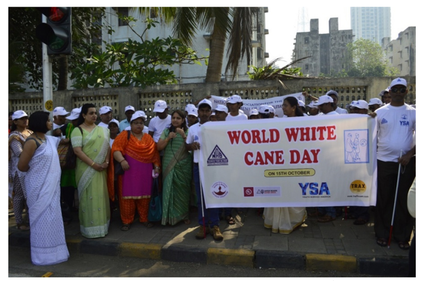
Figure 3. Celebration of World white cane day on 15<sup>th</sup> October

On 15th Oct, 2016 which is World White Cane Day a field survey was conducted to understand the awareness amongst the general public about the right technique to help a blind person cross a street so as to avoid road accidents. World white cane day is celebrated worldwide to commemorate the achievements of the visually challenged and also to highlight the importance of the white cane, which stands as the symbol of the safety of the visually challenged people.