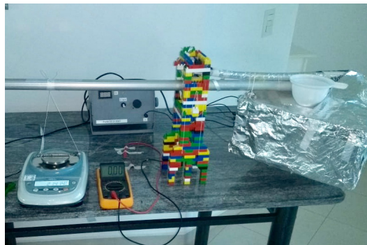
Figure 2: Photo of the experimental setup implemented to realize the measurements of anomalous upward forces acting on the symmetric capacitor. The equipments used in the experiment were a milligram digital scale, an ampere meter, the high-voltage power supply with volt meter (in the background), pivot (built with Lego) and box with aluminum coverage. A metallic arm supported by the pivot connects mechanically the box where the symmetric capacitor is enclosed and the counterweight in its ends.