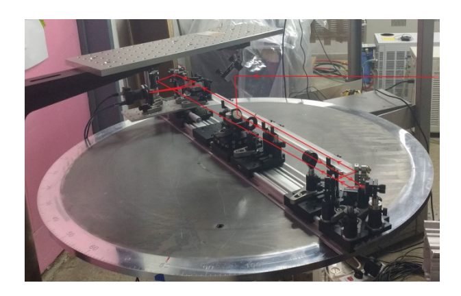
Figure 1. The Goniometer & Optical Bench. The red line represents the trajectory of the laser pulse with arrows indicating the direction of propagation of the pulse

Laser pulses from a 25fsec Ti: Sapphire laser are delivered to the optical bench, see Figure 2. The laser is a 20fsec Spectra Physics Tsunami oscillator, followed by a regenerative amplifier. The pulse energy, at a wavelength of 798nm, is 3mJ, and the repetition rate is 10 Hz. The laser beam diameter is \sim 0.8 \text{cm} . Our system superimposes two laser beams on a Barium Borate (beta-BaB<sub>2</sub>O<sub>4</sub>, BBO) crystal that serves as our autocorrelator. The 600mm optical rod, constructed of two 300mm rods, serves as an optical delay line that ensures the simultaneous arrival of the two pulses to point C, Figure 2, on the first arm and at point G on the second arm.