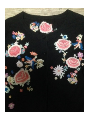
Figure 4. Embroidery handcraft decorations

Consequently, based on the recognition of interviewees, handwork production method was particularly highlighted in the handcraft decorations of clothing and they gave great values on the rarity derived from the