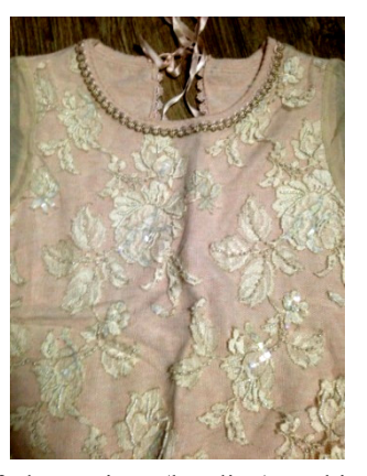
Figure 6. handcraft decorations (beading) evoking creator's efforts

Since human experiences and ideas are reflected in the work, the material can represent a human and convey them to others as a medium. Experience can be shared with others and make us understand the suffering process of creation even though we cannot see it directly. The efforts and toils the observer has perceived from the handcraft decorations triggered the emotion of empathy with the creator, and this attaches higher value to the material clothes again.