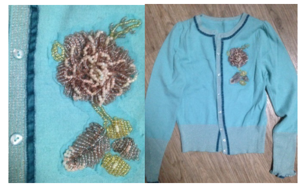
Figure 5. Handcraft decorations performing the key role of the clothing