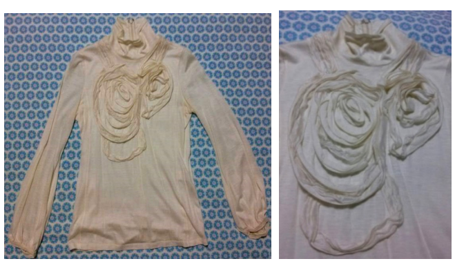
Figure 1. Irregularity charateristics in handcraft decorations of clothing

In the preliminary survey, respondents mentioned the most beading (85%) and embroidery (51%) as the handcraft decorations technique (a duplicate item response). There may be various details decorating clothes by handcraft methods but it showed consumers had limited recognitions on the techniques to express handcraft decorations of clothing mainly as beading and embroidery. Besides, some in-depth interviewees connected some decorations to handcraft decorations if they showed irregular characteristics (Figure 1).