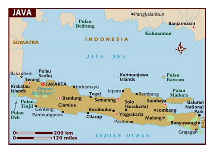
Map of Central Java, Indonesia

Most importantly, however, Surakarta is famous not only for the Javanese culture but also traditional snacks. The typical and traditional culinary assets of Surakarta that were identified and should therefore be preserved include: