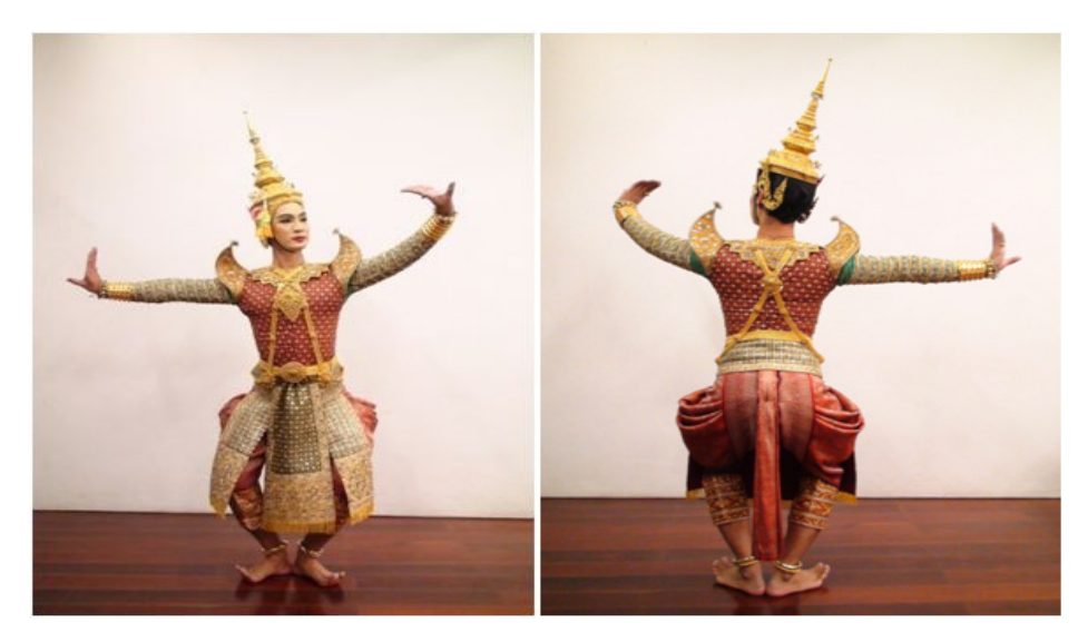
Figure 11. The fully dressed hero, front and back