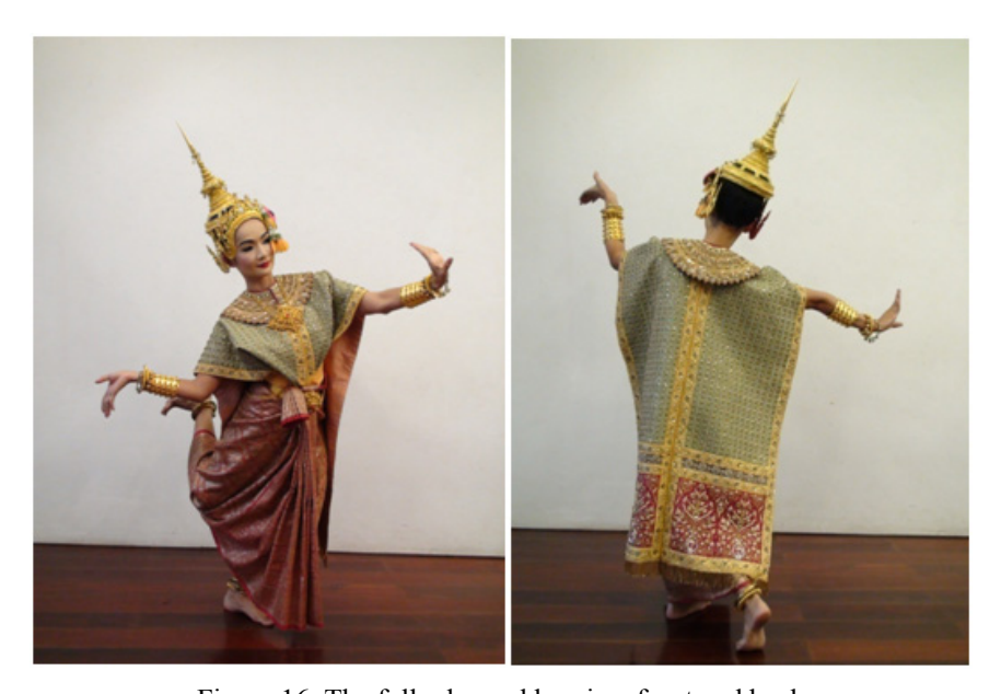
Figure 16. The fully dressed heroine, front and back

Step Twelve: The siraporn is placed on the head of the performer to complete the costume (Figure 16).