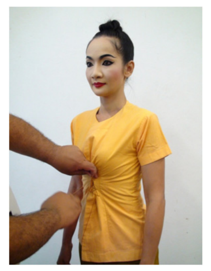
Figure 12. The inner shirt sewn onto the heroine

Step One: The inner shirt is sewn on. It is popular for the heroine to wear a yellow coloured inner shirt. The shirt may be short or long-sleeved, although a short-sleeved shirt could expose the armpit and breast of the performer (Figure 12).