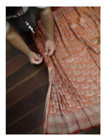
Figure 1. Crimping of the pa nung

Step Two: The actor puts on sanab plao with the arched curves at the bottom hem in the centre of the shin, just below the knee. Ankle bracelets are worn and accompanying ankle rings worn below them ( Fig ure 2).