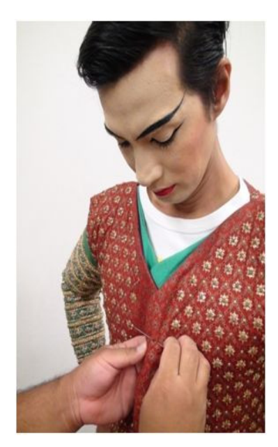
Figure 7. Stitching the outer shirt

Step Nine: The radsa-aew is stitched to the outfit around the waist using the excess thread attached to the shirt. The fabric is then arranged neatly on the performer and the radsa-aew is stitched into the tail piece (Figure 8).