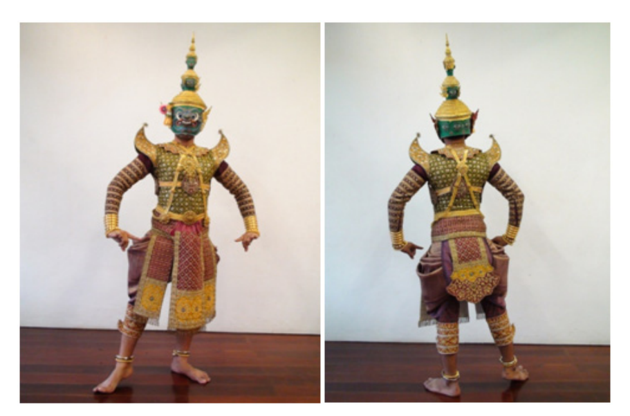
Figure 18A-B. The dressed ogre, front and back

The ogre's siraporn includes a face mask (Figure 18).