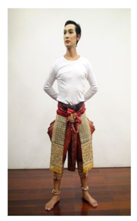
Figure 5. The hero wearing the hoy kang

Step Six: The performers must wear padding to exaggerate their chest and more closely resemble Thai sculptures. The inner padding is placed over a vest or t-shirt and stitched under the performer's undershirt with thick zigzag stitching. The sleeves are also stitched while the performer wears the shirt ( Figure 6).