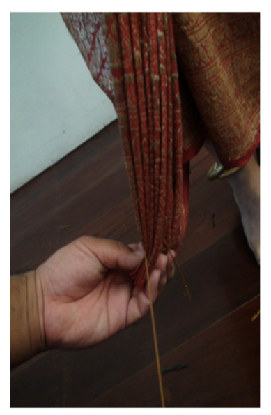
Figure 15. A costume artist helping the heroine to wear the pa nung

Step Eleven: An ornamental belt is fastened around the waist, a pendant is worn around the neck and decorative vambraces, beaded bracelets and waen rawb are worn on the wrists in the same style as the hero.