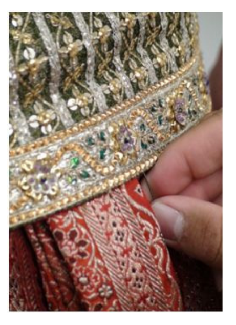
Figure 8. Stitching the radsa-aew to the tail piece

Step Nine: The radsa-aew is stitched to the outfit around the waist using the excess thread attached to the shirt. The fabric is then arranged neatly on the performer and the radsa-aew is stitched into the tail piece (Figure 8).