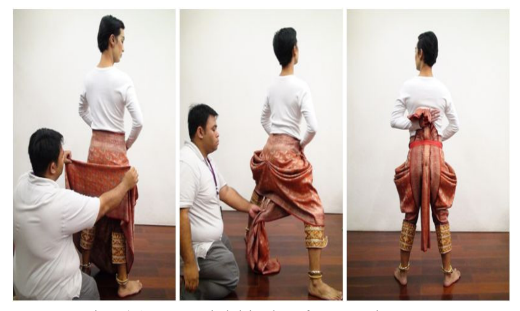
Figure 4. A costume artist helping the performer wear the pa nung

Step Four: The pre-stitched pa nung is wrapped around the performer by a costume artist. The artist will triple-pleat the pa nung at the back of the performer, wrap the excess fabric around the front and draw it through the performer's legs to the back again, where it will be worn like a loincloth. The actor must also help during this process by holding the fabric tightly in place while it is being crimped and pulled. A piece of plain fabric will be used as a belt to hold the pa nung in place. This fabric is also known as a tail fastener because the pa nung is draped down to create a tail at the back of the performer. If the fabric belt is not fully expanded, it will hurt the hips of the performer. The pa nung is arranged neatly by the costume artist and the belt tied at the front of the performer (Figure 4).