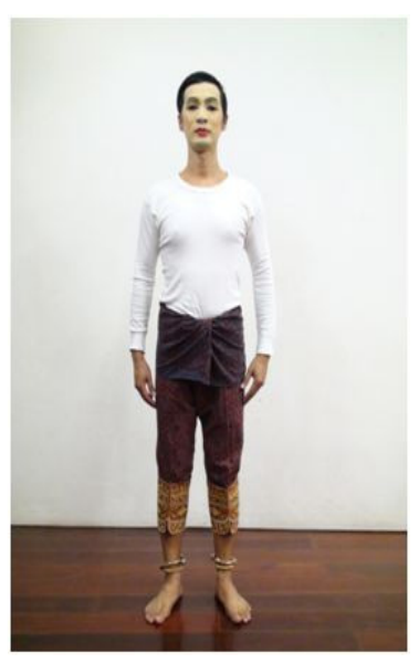
Figure 2. The hero wearing sanab plao, ankle bracelets and ankle rings

Step Two: The actor puts on sanab plao with the arched curves at the bottom hem in the centre of the shin, just below the knee. Ankle bracelets are worn and accompanying ankle rings worn below them ( Fig ure 2).