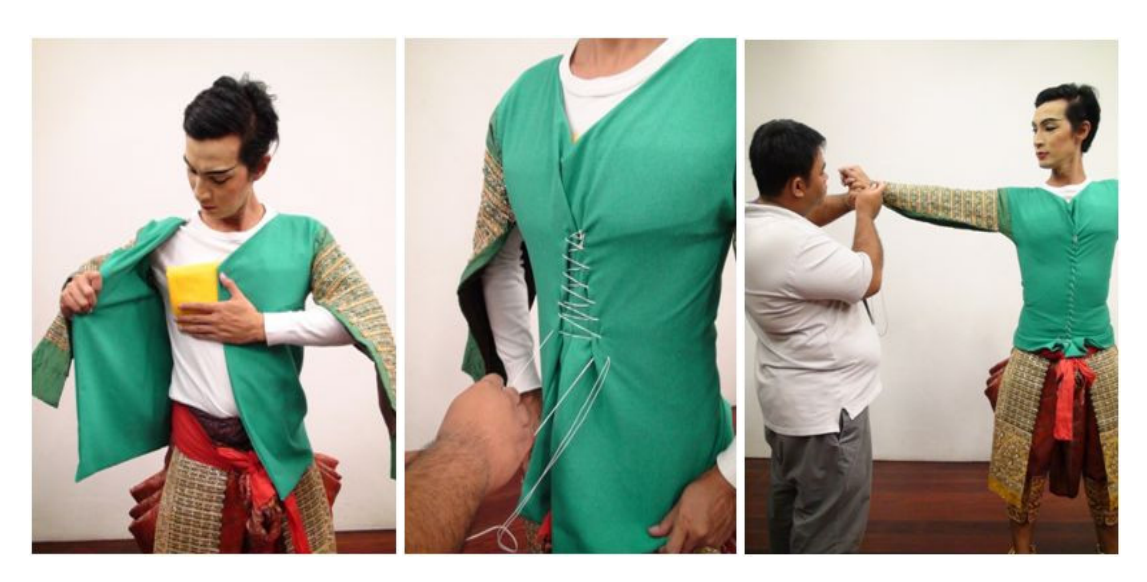
Figure 6. Traditional embroidery to attach the inner shirt to the hero

Step Six: The performers must wear padding to exaggerate their chest and more closely resemble Thai sculptures. The inner padding is placed over a vest or t-shirt and stitched under the performer's undershirt with thick zigzag stitching. The sleeves are also stitched while the performer wears the shirt ( Figure 6).