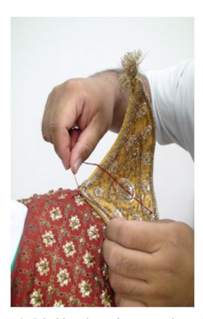
Figure 9. Stitching the inthorn-tanu into place

Step Twelve: The krong kaw, similar to an Egyptian usekh, is attached to decorate the performer's neck area.