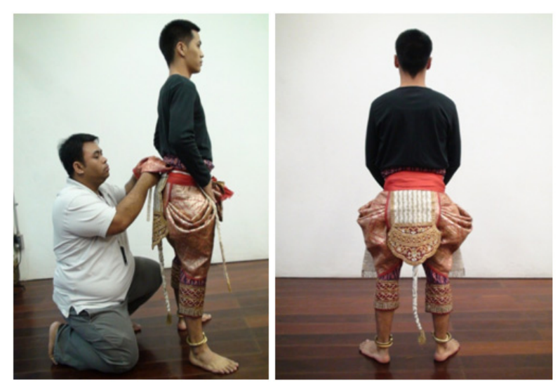
Figure 19. A costume artist attaching the monkey's tail