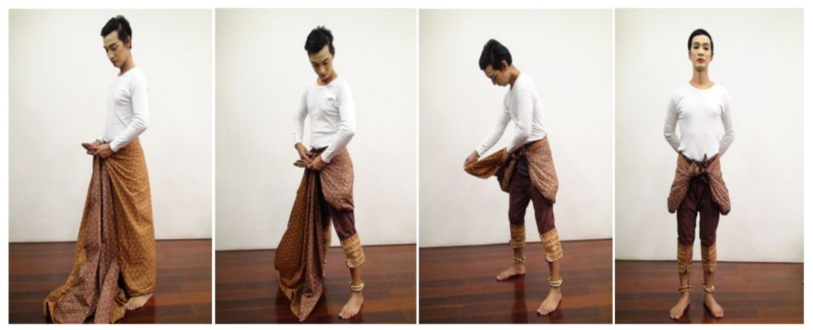
Figure 3. The hero wearing the pa pawk

Step Four: The pre-stitched pa nung is wrapped around the performer by a costume artist. The artist will triple-pleat the pa nung at the back of the performer, wrap the excess fabric around the front and draw it through the performer's legs to the back again, where it will be worn like a loincloth. The actor must also help during this process by holding the fabric tightly in place while it is being crimped and pulled. A piece of plain fabric will be used as a belt to hold the pa nung in place. This fabric is also known as a tail fastener because the pa nung is draped down to create a tail at the back of the performer. If the fabric belt is not fully expanded, it will hurt the hips of the performer. The pa nung is arranged neatly by the costume artist and the belt tied at the front of the performer (Figure 4).