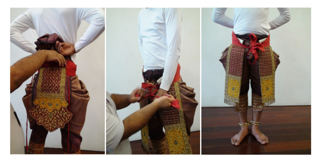
Figure 17. Application of the ogre's bid gon and hoy kang

The ogre's siraporn includes a face mask (Figure 18).