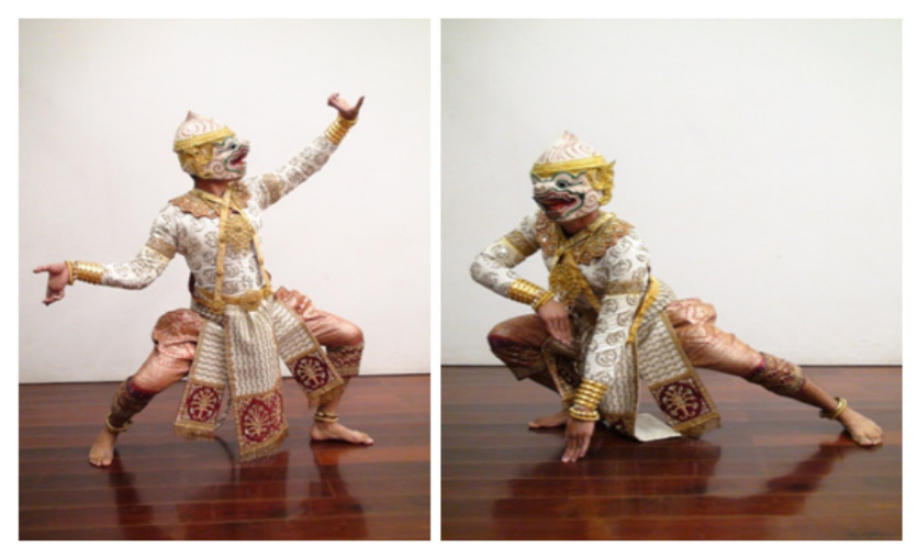
Figure 20. The dressed monkey