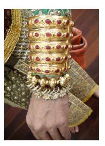
Figure 10. Arm accessories for the hero

Step Thirteen: Accessories are added to the costume. A pendant is worn around the neck, sitting in the centre of the chest. An ornamental belt is fastened around the waist, with its head in line with the pendant. Decorative vambraces are worn on the wrists, as are beaded bracelets and a bracelet of rings or waen rawb (Figure 10). A sangwan is then placed over the head of the performer. This is an ornamental set of crossed braces at the front and back. It is customary for the actor to make a wai gesture by placing their palms together in front of their head before wearing the sangwan .