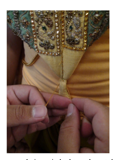
Figure 14. The pa-hom nang being stitched together at the front of the heroine

Step Five: The pa-hom nang is stitched to the inner shirt at the front of the performer (Figure 14).