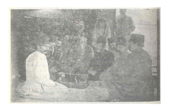
Figure 2. An opaque photo of Nasser-al-Din shah playing chess (Bamdad, 2008)