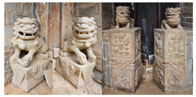
Figure 2. Stone carving lion on the bearing stone (source: drawn by the authors)