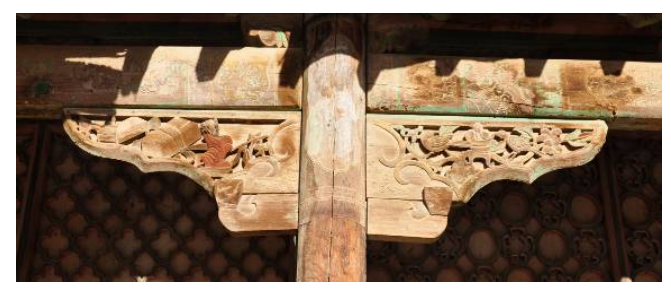
Figure 6. Wood carving of the sparrow brace in the wing-room of the major courtyard (source: drawn by the authors)