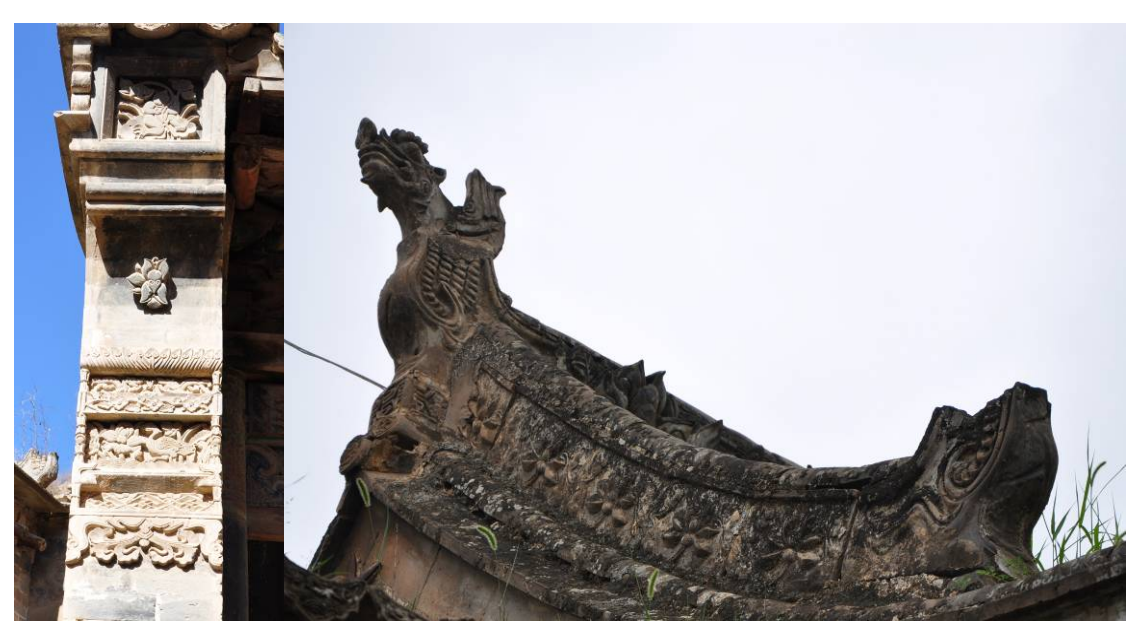
Figure 4. Tile carving of Chitou and ridge (source: drawn by the authors)