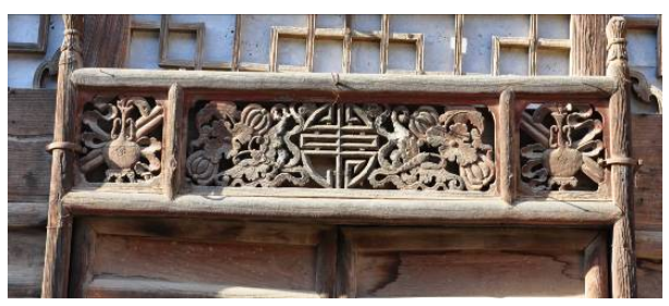
Figure 5. Wood carving of the lintel in the front cave dwelling of the major courtyard (source: drawn by the authors)