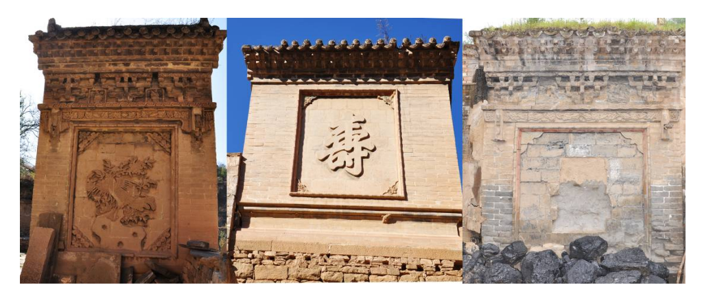
Figure 3. Tile carving of the screen wall in Dangshi manor