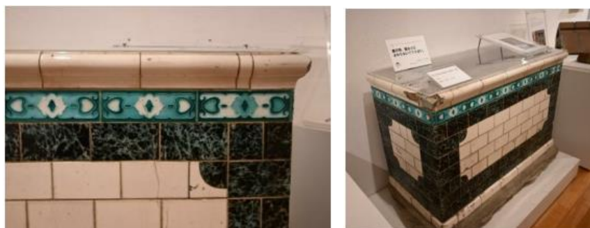
Figure 5. Example of Japanese Majolica tile tiles used in Japan: show window

Note. The base of a display shelf used as a show window in a store. The tiles in the second row from the top are Japanese majolica tiles. (Former Hashimoto-ya display cabinet in Tsumaki Town, unknown manufacturer, approx, 1932).