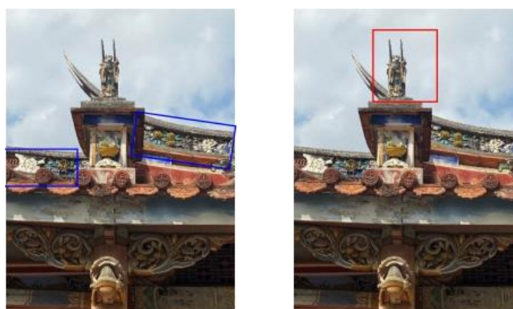
Figure 7. Taiwan Traditional Architectural Decoration

left: Chien-nien (i.e cut-and-paste decoration) right: Koji Ceramics