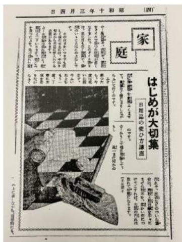
Figure 1. Tile Advertisement Tile, Washrooms, Toilets

The second major event was the Great Kanto Earthquake of 1923. After the Great Kanto Earthquake, reinforced concrete buildings were constructed to replace brick buildings. To protect that concrete, fire-resistant tiles began to be used for exterior walls, and tiles quickly became popular. A March 4, 1935, Asahi Shimbun column for households used “whiteness” and “cleanliness” synonymously and reported that tiles were used in the kitchens of ordinary homes in the early Showa period (1926-1945) (Figure 1). Other examples of the values of hygiene and tiles, and white = sanitation, can be seen in newspaper advertisements of the time (Figure 2).