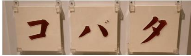
Figure 10. Japanese Majolica tile for tobacco shop sign (Japan, Saji tile Co, Early 20th century)