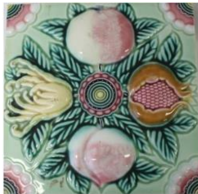
Figure 12. Chinese auspicious pattern: Three fruits design

Note. Auspicious pattern also known as “Sanda”. Pomegranates, apples, peaches, and tangerines are depicted. Sanda means “many children,” “long life,” and “many blessings.”