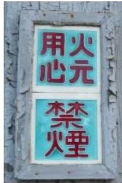
Figure 11. Non-smoking tiles, fire-retardant tiles (Manufacturer Unknown, Location Tomioka Silk Mill)