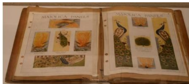
Figure 8. Tile catalog clipping from an English tile company

Thus, production of this tile, which began as an imitation of Western designs, gradually developed tiles with uniquely Japanese designs that were not found in Victorian majolica tiles. The fact that the tiles were designed and manufactured in accordance with the culture of the region where they were sold may be one of the reasons why they were so well accepted in Taiwan.