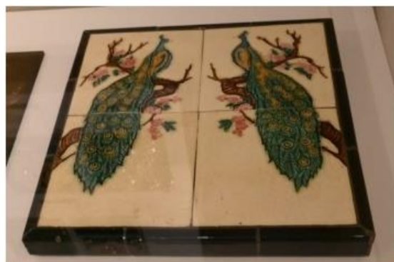
Figure 9. Tiles with the same pattern seen in the scratchbook in Figure 8 are manufactured by a Japanese manufacturer (Hirosho Tile Company, Japan, early 20th century)

Note. Scratch book compiled by the former president of Saji Tile. (Early 20th century).