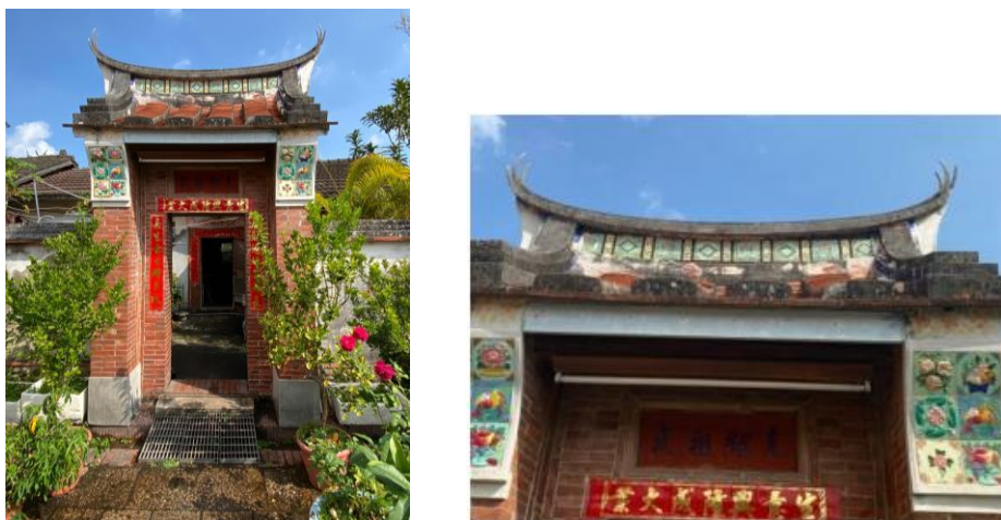
Figure 6. Example of Japanese Majolica tile tiles used in Taiwan (Zhang Family Ancestral Temple)

Note. The base of a display shelf used as a show window in a store. The tiles in the second row from the top are Japanese majolica tiles. (Former Hashimoto-ya display cabinet in Tsumaki Town, unknown manufacturer, approx, 1932).