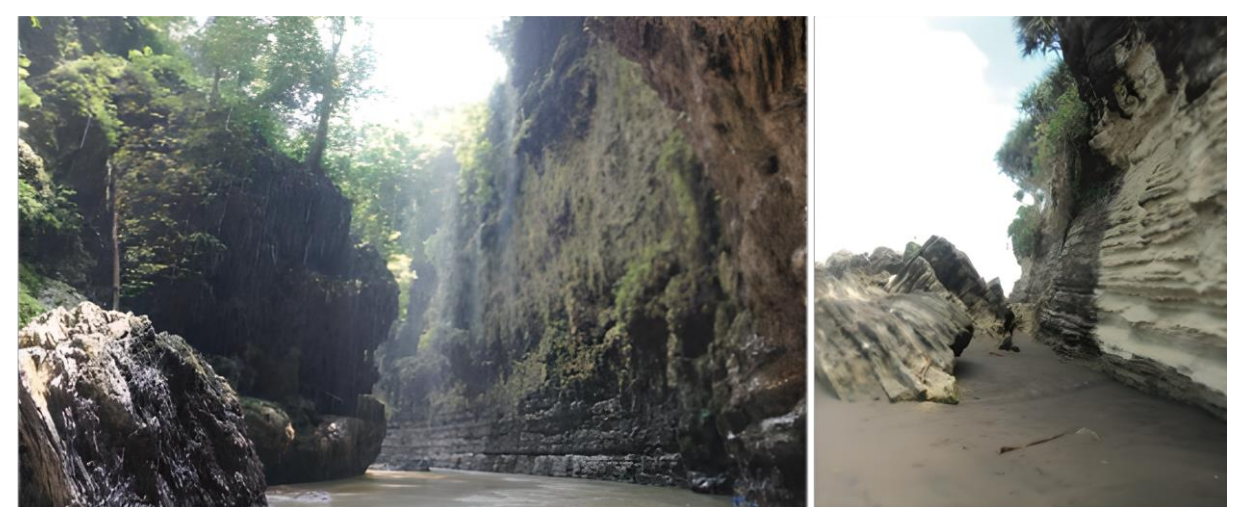
Figure 5. Outcrop in Batu Hiu beach (right) and in Cijulang (left), Pangandaran area, showing alternation of calcarenite sandstone and marl (Anshori et al., 2016)