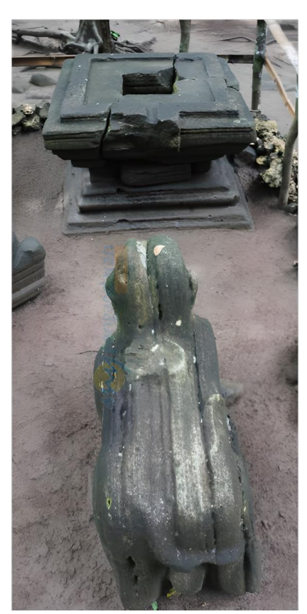
Figure 6. Oblique picture of yoni (top) and Nandi statue (bottom), showing boundaries of the original bedded sandstone at horizontal (yoni) and vertical (Nandi) position

Note. Due to the presence of a bed boundary, tail part could not be carved right in the middle of the statue body and slightly shifted to the left position. The flat right side of the statue is most likely caused by the dislodgement of rock beds.