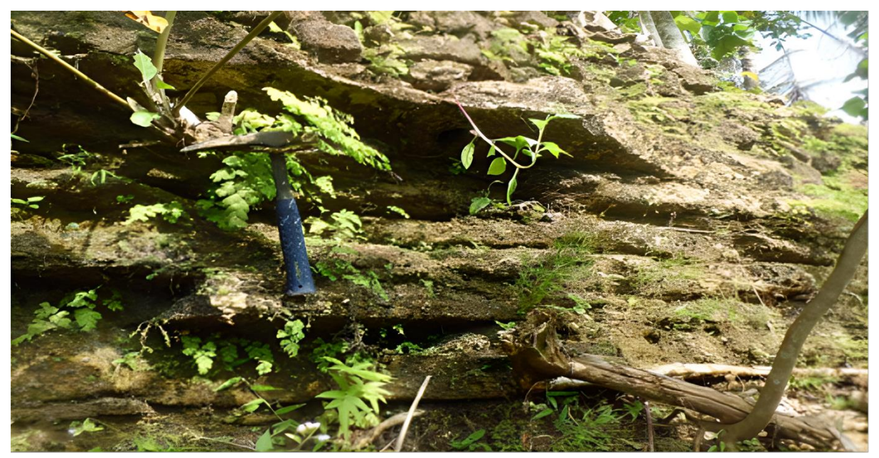
Figure 4. Outcrop of carbonaceous sandstone of the Pamutuan Formation in Kertajaya Village, Pangandaran area