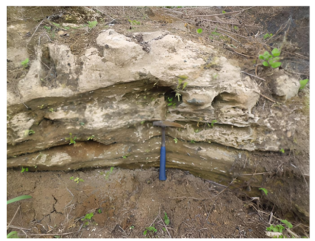
Figure 3. Outcrop of bedded limestone of the Pamutuan Formation in Cigugur Village, Pangandaran area, showing alternation of brownish white limestone and fine-grained reddish-brown limestone

The use of bedded sandstone as a temple stone may be related to the absence of a plinth under the Nandi statue found at BKT. The Nandi statue at BKT is made of bedded sandstone where the boundaries of the beds are in a vertical position and seem to slice Nandi's body vertically. On Nandi's body, these beds are still firmly attached to each other on a wide surface. However, for the plinth, the surfaces that stick together will become much narrower so that the sandstone beds will easily be separated from one another. This issue has most likely been considered by the Nandi statue maker so that the Nandi statue in BKT was made without a plinth, and it looks different from the Nandi statues found in Central and East Java. The flat surface on one side of Nandi's body may be the appearance of the original surface of the sandstone bed after the part of the statue on that side is dislodged, not because the Nandi statue was deliberately designed to stick to the wall as Ferdinandus et al. (1987) suspected. Due to the presence of a bed boundary, tail part could not be carved right in the middle of the statue body and slightly shifted to the left position (Figure 6).