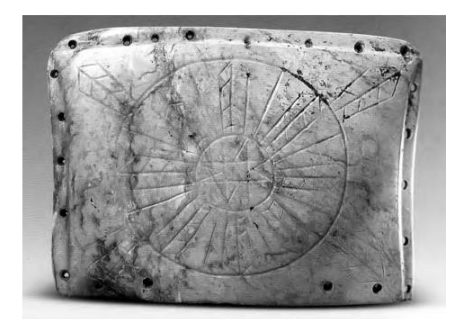
Figure 2. Jadeplate unearthed Lingjiatan Site in Hanshan county

Problem on the origin of Qin people has been controversial, and theory Qin people from the east is becoming a mainstream in recent years, and has been to help the western Zhou dynasty to protect northwest frontier until PinWang begin Eastward migration. After 500 years of struggle, finally completed the Huaxia world unify, and opened a new era. The ruins of the Qin people in lixian county, Gansu province are enough to show that the early history of the Qin people developed gradually from the northwest. This historical trend has profoundly affected the Chinese people's summary of history and created the very important concept of Chinese ideological history.