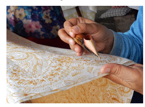
Figure 6 Canting