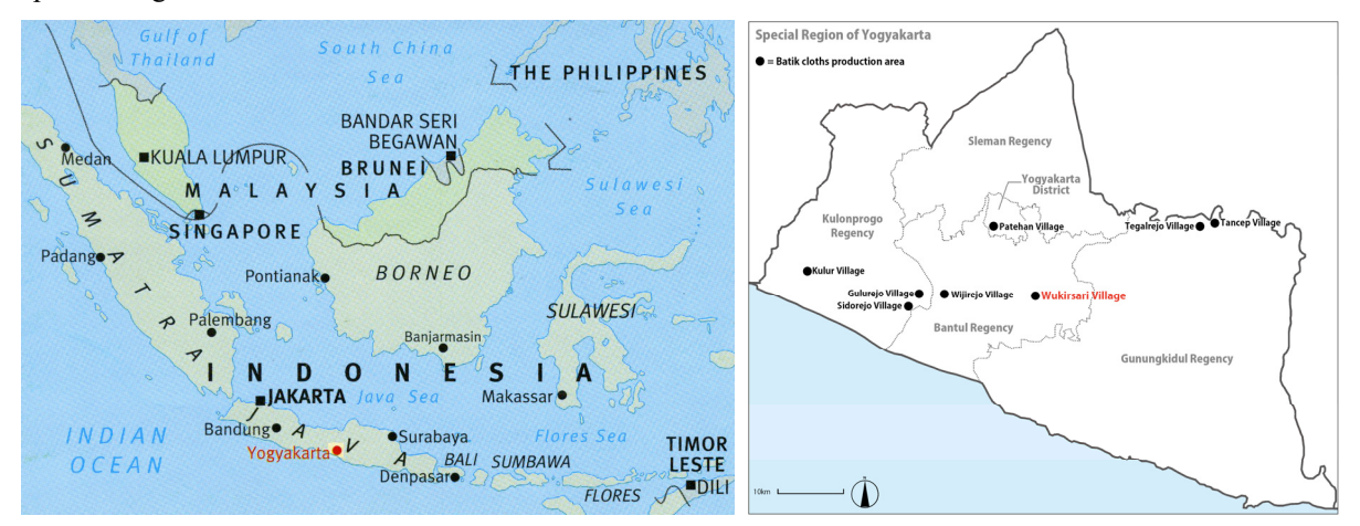
Figure 3 The location of Special Region of Yogyakarta in Indonesia

place for the royal family (Makam Imogiri). Craftspeople of Batik in Wukirsari Village almost gather in Karangkulon hamlet, Giriloyo hamlet and Cengkehan hamlet, which are called Kampung Batik Giriloyo in general. Female residents account for the majority of Batik craftspeople, and there are 16 Batik cloths production organization in Kampung Batik Giriloyo as of 2015. In this study, kampung Batik Giriloyo is taken as the specific target site.