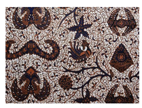
Figure 1 Woman drawing a pattern with wax on cloth Figure 2 Batik cloth