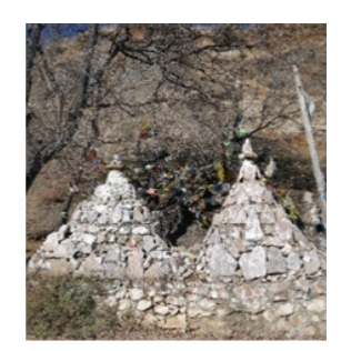
Figure 2. Mani Lumps (Photos by Wei Yu, January 2017)