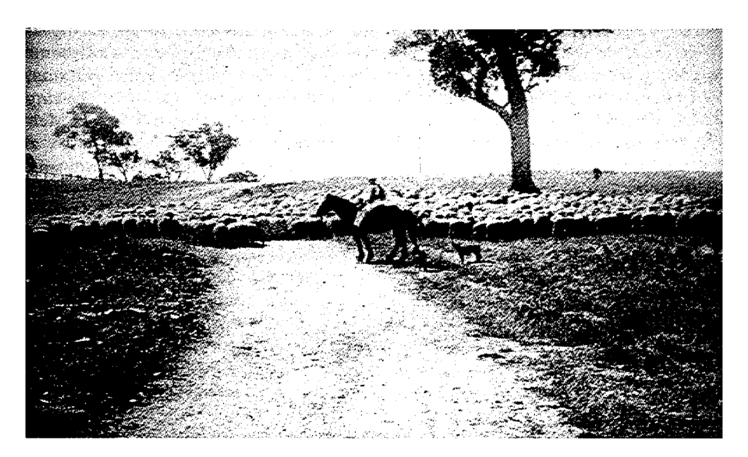
Figure 3. A Girl of the Bush (1921). A few trees, a solitary horseman and a multitude of sheep, rough tracks, and burning white roofs, symbolizing wealth, human cultivation and control

In these films, characteristic and impressive shots show a station in a wilderness, a few (or a lone) tree(s), a solitary horse(wo)man and a multitude of sheep, rough tracks, and burning white roofs, which symbolize wealth, human cultivation and control (Figure 3). This can be seen in A Girl of the Bush (1921), in The Hayseeds (1933) and in The Squatter's Daughter (1933). As Tulloch argues, the cultural icons support this comforting notion of purpose and control. The theme of human dominance and control is clearly demonstrated by the competent pioneer on the edge of civilization. This is the mark of progress (Tulloch, 1981, pp. 139-140). This "progress" and "control" are achieved by the victory of human culture over untamed nature. For example, in The Squatter's Daughter , the opening shots show the "achievements" of one and a half centuries of white European settlement in the Monaro in New South Wales. The large flock of sheep, "surely the largest ever assembled anywhere in the world in front of a camera", is proudly paraded before the eyes of the viewer (Hoorn, 2007, p. 69). Produced for international audiences, the film shows the basis for the creation of the wealth which supported the European development of Australia. The image was embedded within the self-consciousness of a national "culture" (Note 1) (Hall, 1977, p. 78).