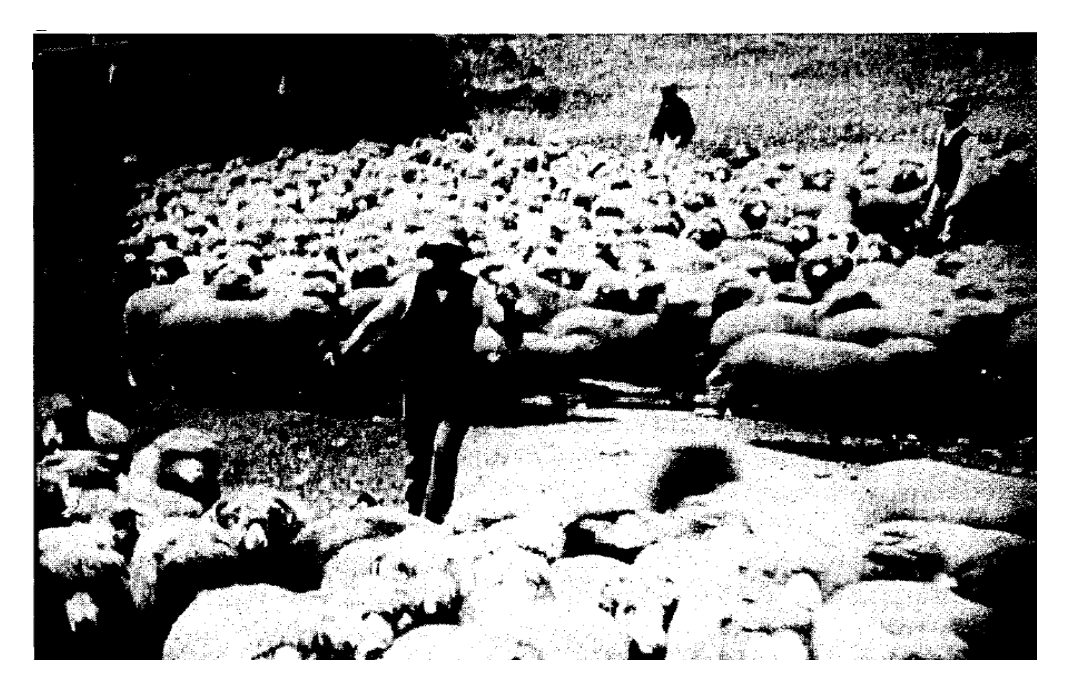
Figure 4. A Girl of the Bush (1921). Abundant sheep: a sign of civilized domestication and "progress"

"culture" and as the "alibi" of the rider's power is much too forced. The fact that the tree has been extracted from its landscape and is visually impressive is not a plausible reason for seeing it as representing "culture". But his opinion is convincing in that this image symbolizes the fact that "culture" controls and dominates "nature", and suggests that the horse(wo)man becomes a real Australian (wo)man in the cultural domain only after he / she is shown to have been successful in controlling nature. In this image, the abundant sheep are a sign of civilized domestication for the use of humans, and more specifically, a sign of the labour undertaken by the horse(wo)man. The rider, sitting comfortably on the horse and watching a crowd of sheep, signifies a pause in the drive to master the land and make it produce wealth. This image is a visual expression of this description of the popularity of paintings on the theme of pioneers, displayed in the Melbourne's Centennial International Exhibition in 1888: "...The unknown wilderness has been made to produce coal and gold, wool and wine...Out of the barren earth there has come wealth, out of the handful of settlers a great people" (Astbury, 1985, p. 130). This image links the legacy of the nation's pioneering image (as the provider of progress, prosperity and civilization out of a "wilderness") in the past to the abundance of the present, to the creation of this material achievement (Figure 4).