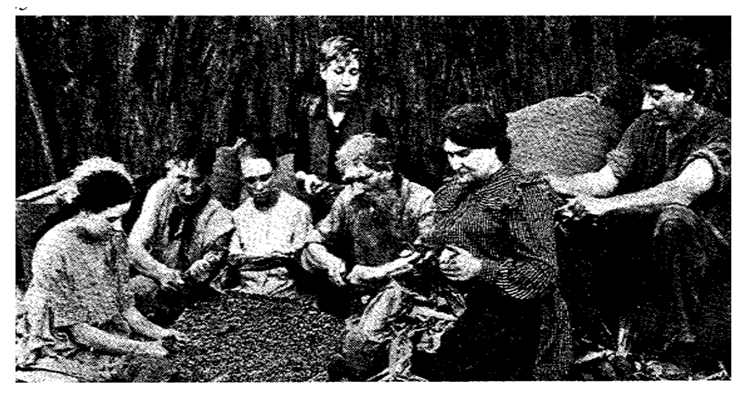
Figure 1. On Our Selection (1920). Rudd's family pulling the ripened corn and shelling the corn with their hands

the family's toil, achieved through the strength of their efforts to turn the wilderness into a humanized and civilized land.