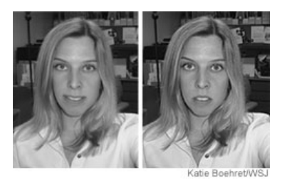
Figure 3. The Happen Face Retouching Function of Sony