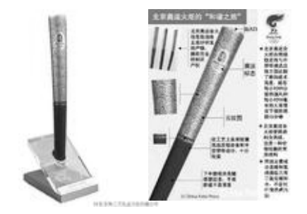
Figure 6. Design of Lucky Clouds Torch in 2008 Olympics