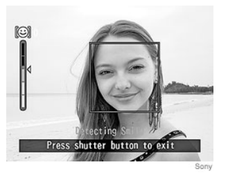
Figure 2. The "cyber-shot" Smile shutter Mode of Sony