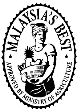
Table 1. Short description about Malaysian's Best Eco-Label

To date, the food safety is one of the essential issues to consumers. They consider so much to harmless of food they are eating, especially in terms of pesticide residues. Malaysia's Best" is a program of the Ministry of Agriculture and Agro-based Industry (MOA). Under this program, only the best produce meeting the requirements of "Malaysia's Best" standards can use "Malaysia's Best" logo, and the government will ensure the best price for these produce. Malaysian Farm Good Agricultural Practice Scheme (Salm) was launched on 31 January 2002 by the DOA. Besides the production of the food, the government is also concerned with the environment in terms of pesticide residues in the soil or on the rivers, as well as fertilizer run-off from the farms, whose overuse of nitrate fertilizers may cause environmental disaster.