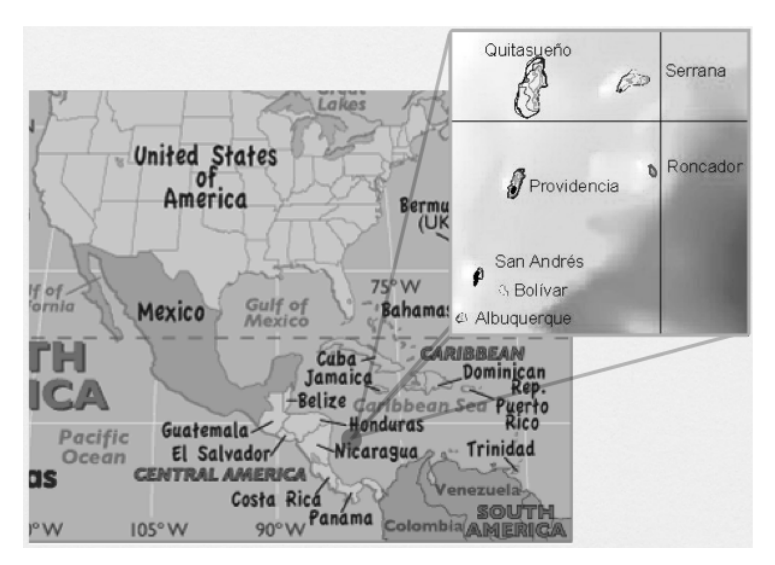
Figure 1. Geographic location of the archipelago

Note: <sup>a</sup> By verbal consent from the land owner. <sup>b</sup> 'Wild' refers to harvesting from growing sites that are not conventionally maintained.