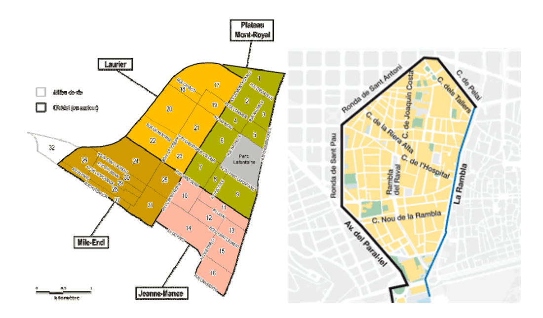
Figure 5. Mile-End and Raval