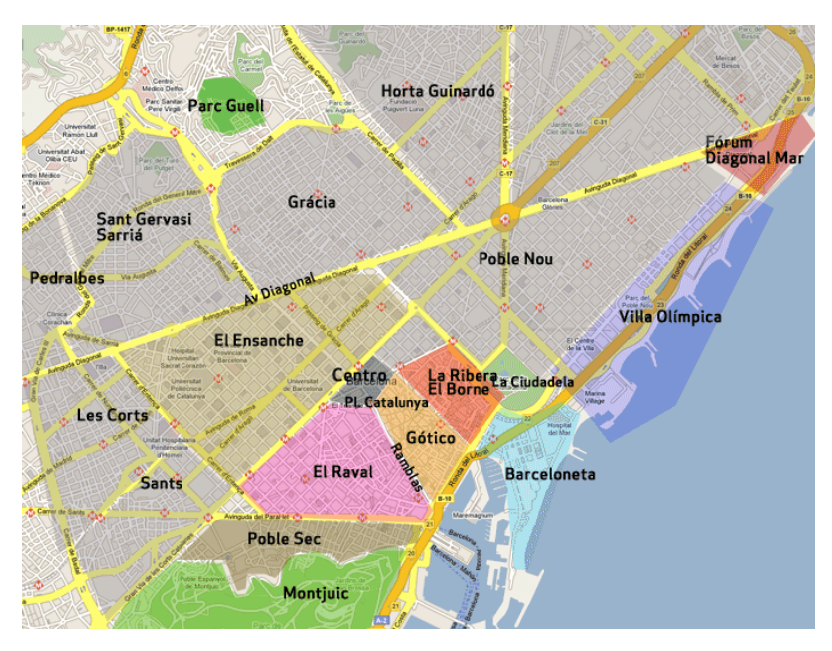
Figure 3. The Ciutat Vella District and its four neighborhoods (El Raval, Gotico, La Ribera, Barceloneta)