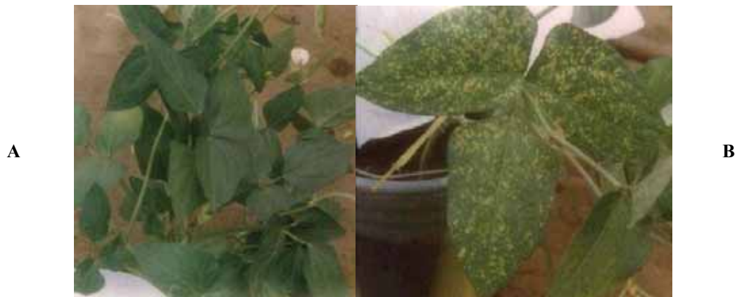
Plate 1. A: Mock-inoculated (control) Cowpea cv. Vita 5 remained without symptoms even at the fruiting stage. B: Cowpea cv Vita 5, inoculated at 7 days after germination with sap from infected leaf of Commelina benghalensis , manifesting severe yellow mosaic symptoms a few weeks after inoculation.