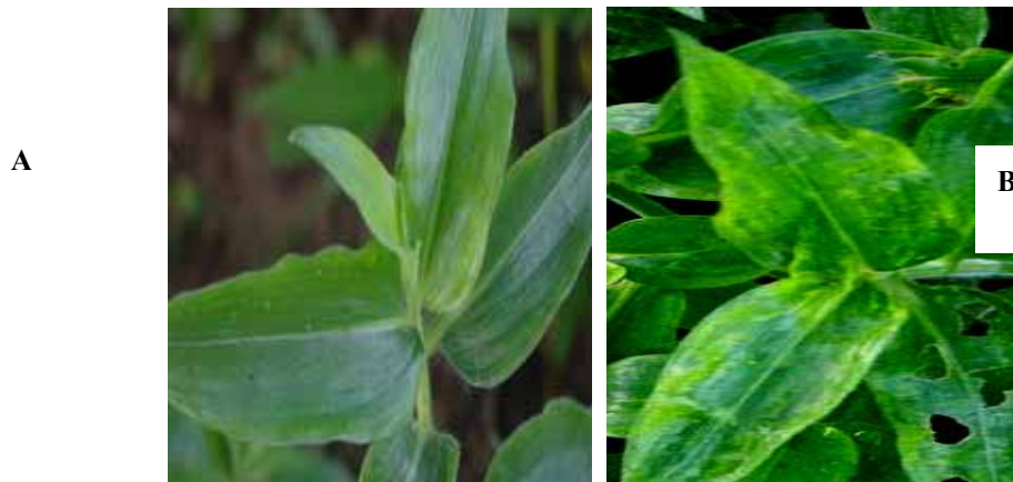
Plate 2. A: Wild Commelina benghalensis without virus (mosaic) symptoms (apparently healthy) B: Naturally infected Commelina plant manifesting yellow mosaic symptoms