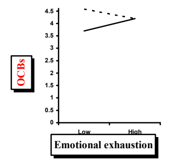
Figure 3. Interaction of emotional exhaustion (EE) and job stress (JS) for organizational citizenship behaviors (OCBs)