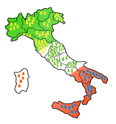
Figure 1. Map of alberghi diffusi in Italy (2016)

In terms of space, alberghi diffusi are organized horizontally, since the bedrooms consist of single houses in the medieval town centre, restored and restructured in keeping with local architectural traditions.