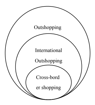
Figure 3. Relationships between cross-border shopping, international outshopping and outshopping