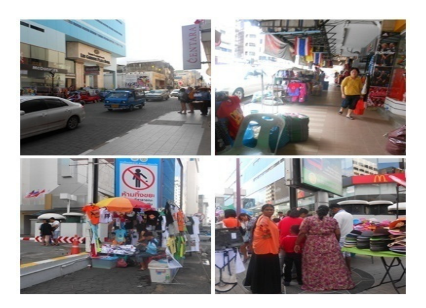
Figure 2. Shopping destinations in Hatyai, Thailand

This study has two objectives: (1) to investigate the impact of consumer ethnocentrism on foreign product judgment; and (2) to investigate the impact of consumer ethnocentrism on local helping purchase.