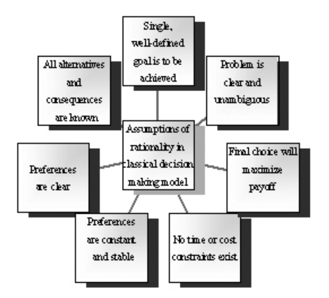
Figure 2. Classical model of decision making