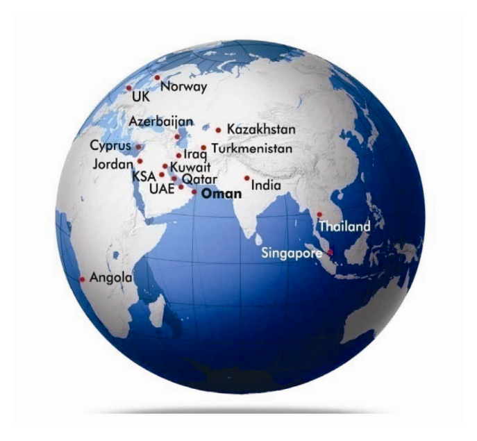
Figure 1. Map of Renaissance Services' Global Business Activities

Renaissance Services, Annual Report, 2010.