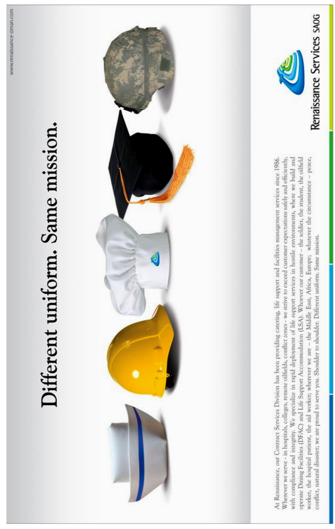
Figure 2. Print advertisement for Renaissance Services (New York Times 2009)