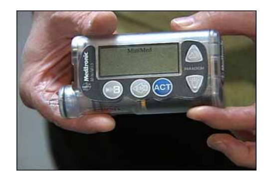
Figure 1. Insulin Pump

Zielke, J.(2007). Sports & Diabetes. Diabetes Forecast, 37-38. Retrieved January 21 2009, from http://www.proquest.com.