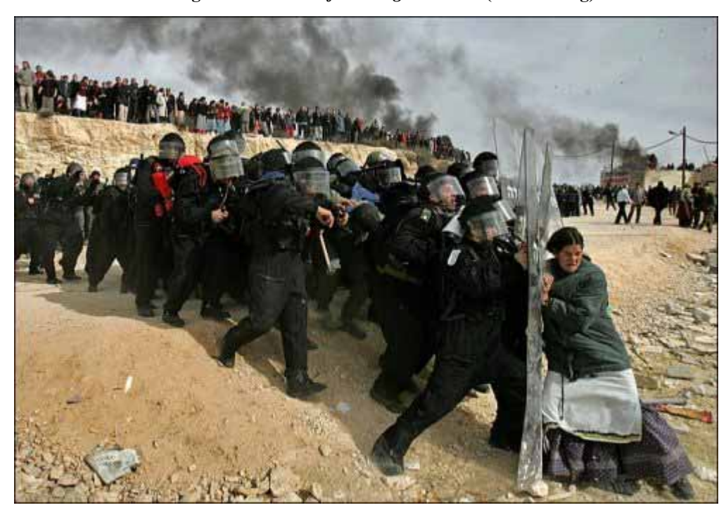
Pulitzer Breaking News Photography 2007 award