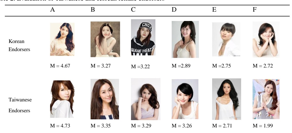
Table 2. Evaluation of Taiwanese and Korean female endorsers

the selection of appropriate endorser rather than to generate representative estimates of the decision of consumers. A total of 30 undergraduate students were asked to view the pictures of each endorser and to indicate how much each of the target traits (appropriateness, trustworthiness, and expertise) described each endorser of the new smartphone products (e.g., 1 = not appropriate at all, 5 = very appropriate). The endorser with the highest score in the evaluation in each sub-group (Korean & Taiwanese endorsers) was selected for the final experiment. The evaluation results of the Taiwanese and Korean female endorsers are shown in Table 2.