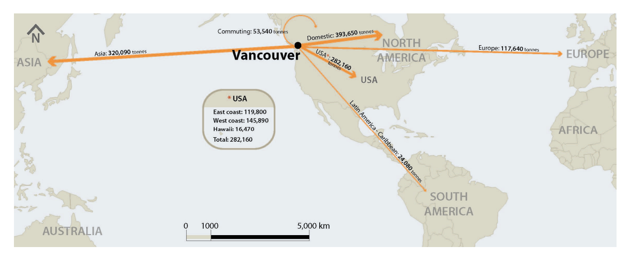
Figure 1a. Metro Vancouver air travel GHG emissions by destination, Approach "A"

Figure 1 (a and b) breaks down Metro Vancouver air travel GHG emissions by specific destinations for both calculation procedures and shows there are considerable differences between them. For example, according to YVR data (Approach A) approximately 43% of GHG emissions were associated with flights to Asia. The Statistics Canada survey data produced a corresponding number of only 21%. Similarly Approach A suggests that flights to Europe account of 15% of GHG emissions while Approach B associates 23% of GHG emissions to European destinations.